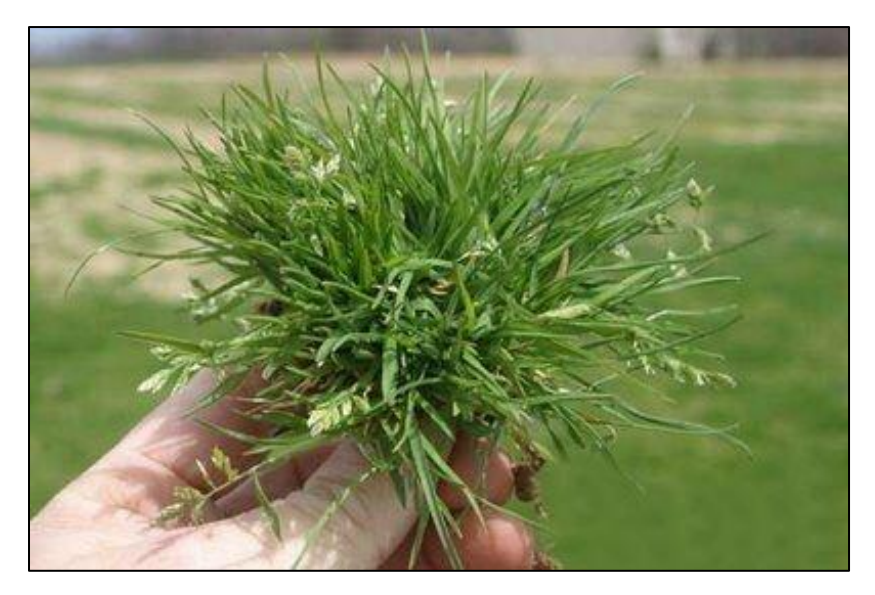
Fig 1. Italian ryegrass (Left) is resistant to both Glyphosate and Glufosinate. Annual bluegrass (Right) is resistant to Glyphosate.

For more information on herbicide resistant weeds, species identification and control options please visit the UC Davis <u>Weed Research and Information Center (https://wric.ucdavis.edu)</u> AND <u>ipm.ucanr.edu/PMG/r606700411.html</u>