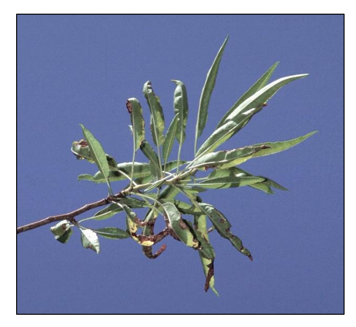
Figure 1. Once new shoots are growing in April and May, pale, potassium deficient leaves roll into a boat shape and develop tip and marginal scorching.

Leaf analysis. Because potassium deficiency can have a significant impact on yield before symptoms of deficiency are visible, leaf analysis is an important tool for monitoring tree potassium status. Leaf samples collected in July are useful for evaluating K levels since leaf tissue levels are relatively stable at that time of year. K levels above 1.4% are considered adequate. UC research was unable to show any yield benefit of pushing leaf potassium much above this adequate level. Some research suggests that too much potassium interferes with uptake and use of calcium and magnesium. However, keeping trees a little above 1.4% may make sense. Leaf analysis results are an average of all sampled trees, so if results land squarely at the 1.4% adequate level that means some trees are above that level and some are below . Overshooting 1.4% will ensure that more trees are above the adequate threshold. Higher than adequate levels will also help provide "back-up" for heavy set years, which may be especially important to sprinkler irrigated orchards where in-season fertigation to meet higher than usual potassium needs is not effective.