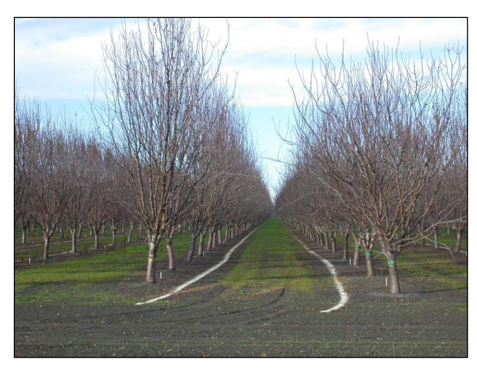
Figure 2. Dormant season band applications of potassium sulfate to every other middle in a non-tilled orchard.