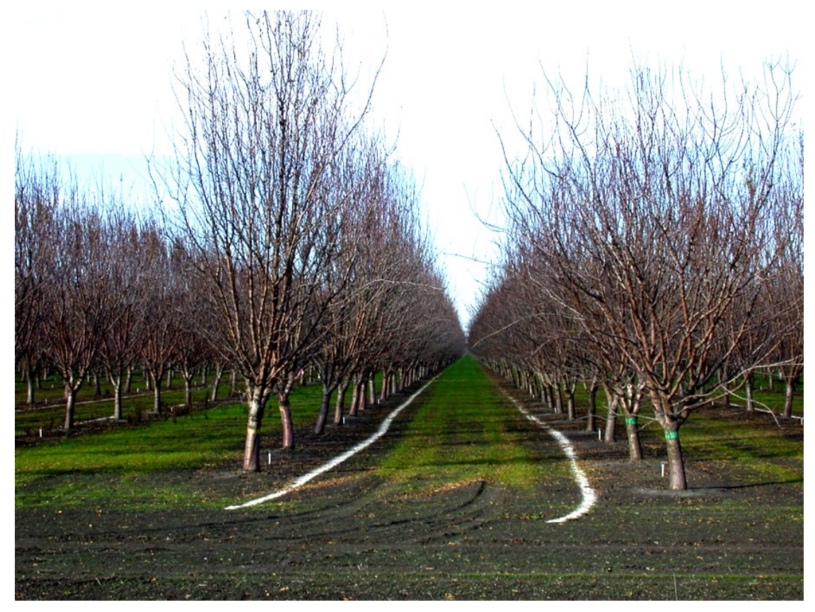
Figure 2. Dormant season band applications of potassium sulfate to every other middle in a non-tilled orchard.