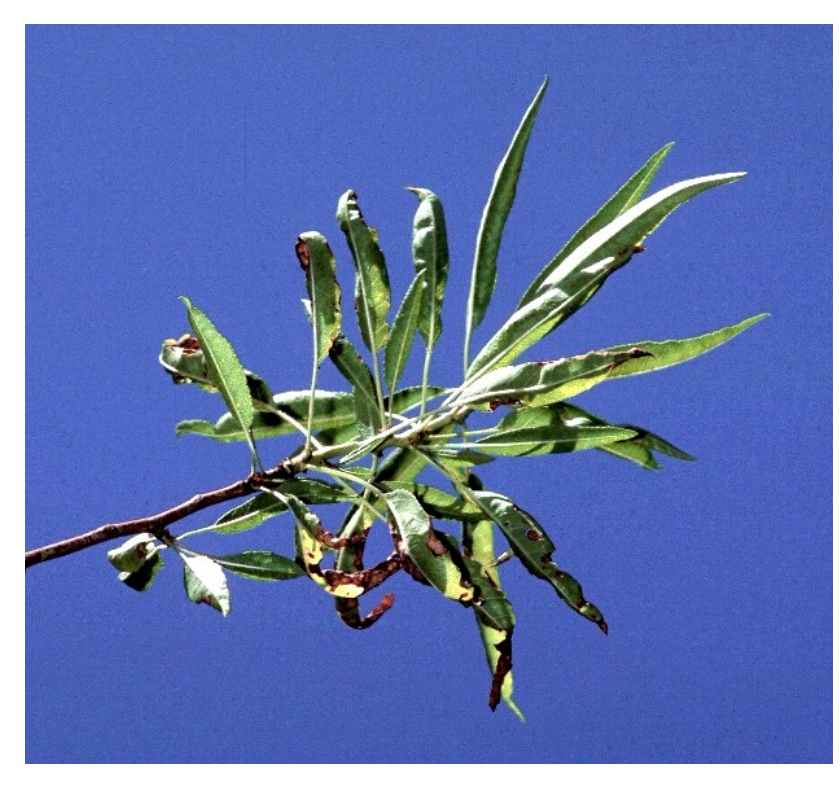
Figure 1 . Once new shoots are growing in April and May, pale, potassium deficient leaves roll into a boat shape and develop tip and marginal scorching.

Visual Symptoms. If trees are deficient enough in potassium to show leaf symptoms, tree health and yield are already being impacted. While it's better to rely on leaf analysis to manage potassium, it's still good to know the visual symptoms of inadequate K. Potassium deficient almond trees show leaf symptoms in the spring if the deficiency is severe but by early summer even milder deficiencies can produce symptoms on heavily cropped trees. If soils are very wet and cold, when first leafing out, potassium deficient trees appear pale in color and have small leaves with little new growth. Once new shoots are growing in April and May, pale, potassium deficient leaves roll into a boat shape and develop tip and marginal scorching. This classic symptom is seen in the tree tops on leaves in the middle of new shoot growth.