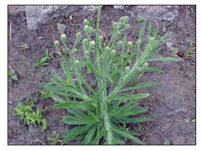
Figure 3. Hairy Fleabane