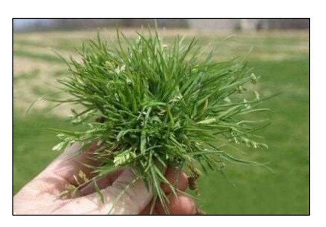
Figure 4. Annual Bluegrass

For more information on herbicide resistant weeds, species identification and control options please visit the UC Davis Weed Research and Information Center <a href="wric.ucdavis.edu">wric.ucdavis.edu</a> OR <a href="mailto:ipm.ucanr.edu/agriculture/walnut/Integrated-Weed-Management/">ipm.ucanr.edu/agriculture/walnut/Integrated-Weed-Management/</a>