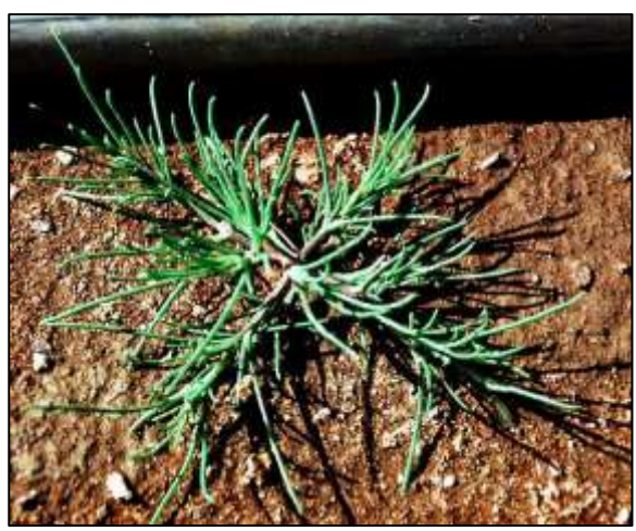
Figure 2. Russian Thistle seedling