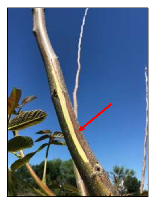
Photos 2 & 3. This characteristic distinct margin of dead and living tissue is typically seen in young orchard blocks. Shown both before (left) and after cutting (right; photos: Luke Milliron).