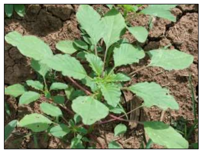
Figure 1. Young Palmer Amaranth

With the growing number of herbicide resistant weeds in California orchards, control of escaped weeds can considerably reduce the cost of an annual orchard floor management program. For example, spot treating two acres of glyphosate resistant palmer amaranth with a tank mix of Glufosinate and Gramoxone is much more affordable than trying to control it over the entire 50-acre block. There are currently thirty confirmed herbicide resistant species in California. Below are pictures of some of the more common resistant weeds in orchard cropping systems. Scout now so you can spot treat, rather than having an orchard full of Roundup resistant weeds in the future.