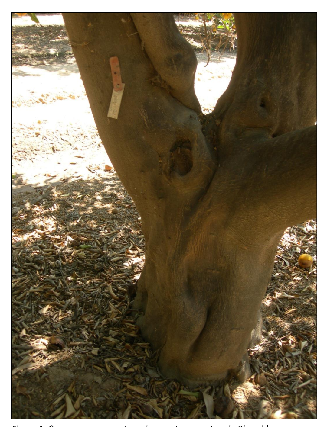
Figure 1. Concave gum symptoms in sweet orange tree in Riverside.