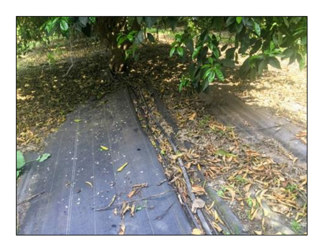
Figure 1. Weed mat in place.

Organic certification: The weed mats will eventually start to disintegrate, which could contaminate his soil. To maintain his organic certification, he will have to rip them up once they start to break down. Smaller, younger trees do not protect the plastic from the sun, which quickly destroys the plastic. For this reason, he recommended against using weed mat in immature orchards.