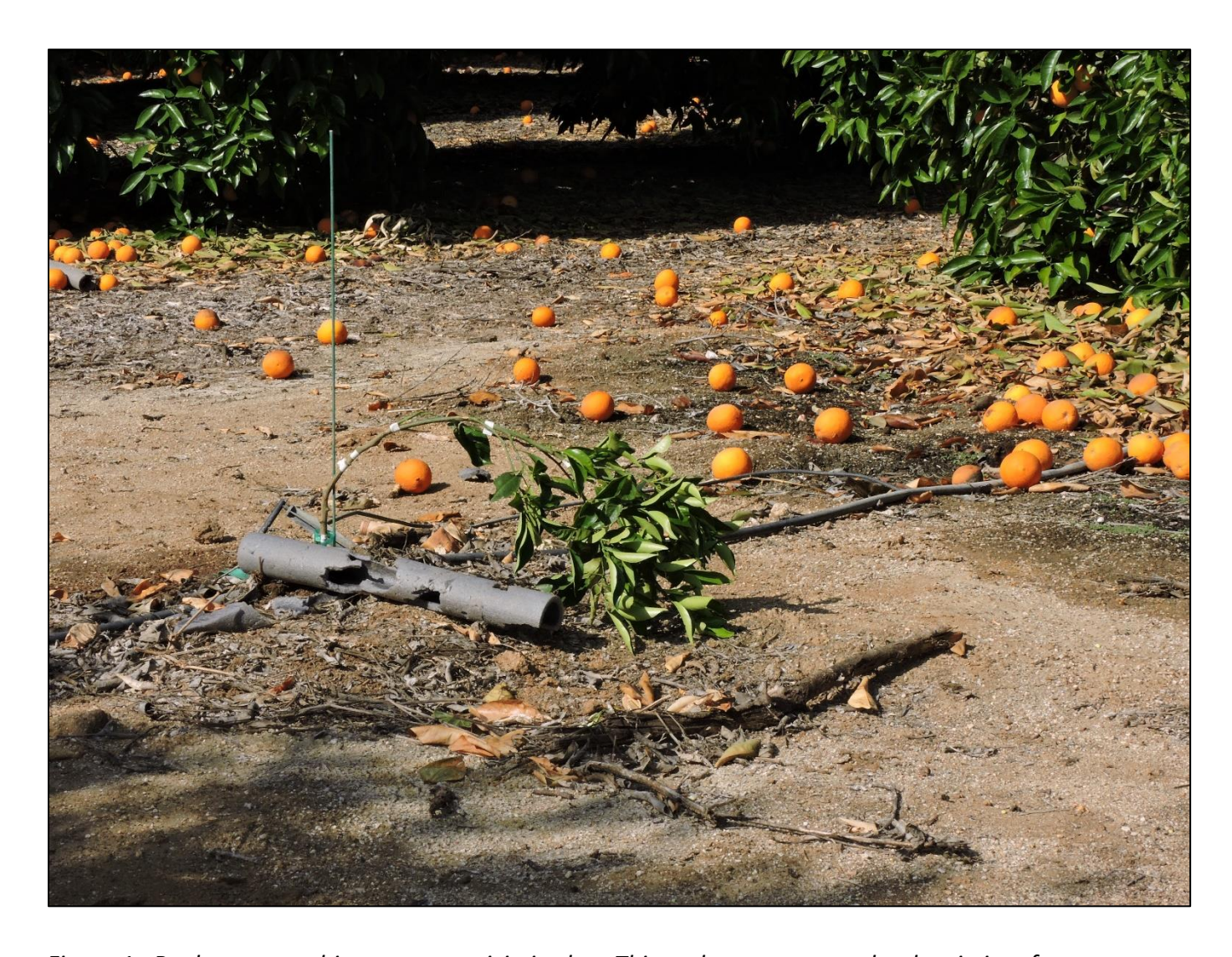
Figure 1. Replants are subject to many vicissitudes. This replant appears to be the victim of crows looking for something to eat in the tree wrap.

Controlling weeds adjacent to replanted citrus avoids excessive competition for light, nutrients, and water. Weeds can become especially thick around replants because of the more open, less-shaded ground around them as compared to the limited area now adjacent to mature trees. When the herbicide applicator encounters these weedy areas, the tendency is to give the replant space an especially heavy application. On young trees this can be especially damaging as the chance for both foliar and root uptake of the pre-emergent herbicides, and foliar uptake and burn from post-emergent herbicides, increases. In heavily replanted groves, the use of only carefully applied post-emergent herbicides may be beneficial until the replants achieve sufficient size to tolerate the pre-emergent materials. Many groves have sufficient residual pre-emergent herbicides to carry them through a year or so of replant establishment without a substantial increase in weed pressure. The hoe is a surprisingly effective tool for keeping weeds under control around replants and provides an opportunity for scheduled inspection of the replants for other possible problems. Gophers quickly find weedy areas and, experience suggests, consider citrus roots just as appetizing as the roots of weeds.