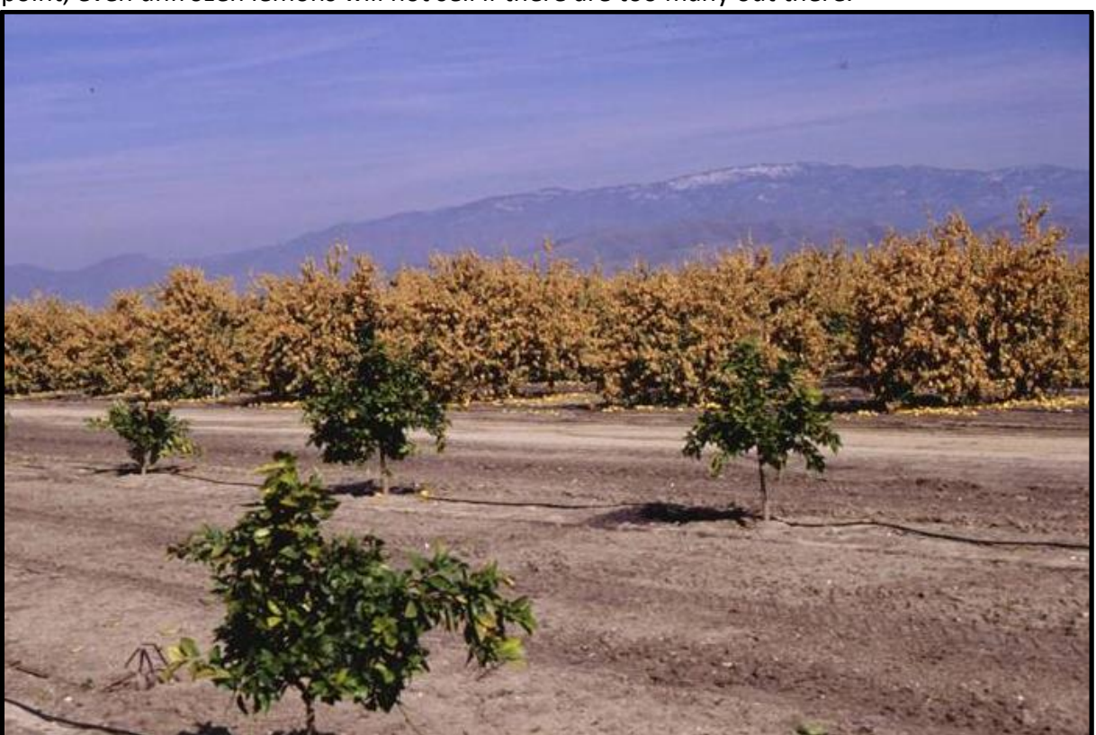
Figure 1. Frozen mature lemon trees in photo background, after the 1998 freeze in the Edison area of Kern County. Juvenile, undamaged navel orange trees in foreground.

The other obvious concern related to the number of enquiries I have received, is that even if lemons are not widely grown in Kern County now, worldwide demand suggests that there are likely many new acres of lemons in the ground now or in advanced planning stages in other locations in California, Arizona and the world. In the past, we have seen the acreage of a number of crop commodities rise and fall with the laws of supply and demand. We have planted and then pulled lemons in Kern County before based on market conditions. At some point, even unfrozen lemons will not sell if there are too many out there.