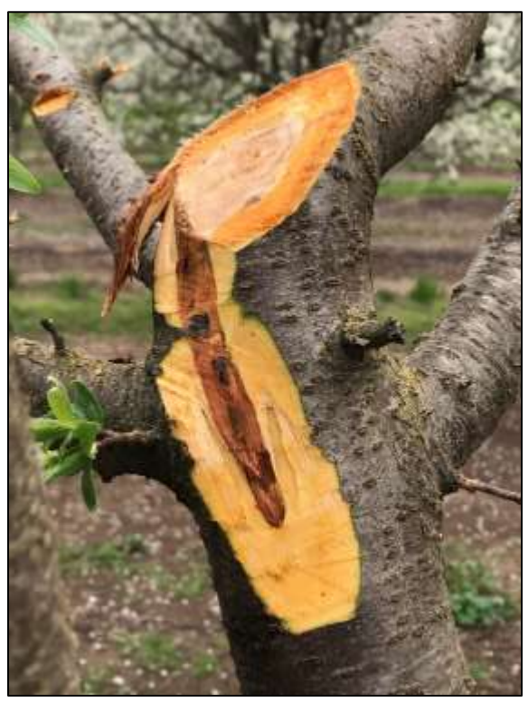
Photo 4 & 5. Orchard with canker dieback was first noticed last year when trees were not flowering out, except low in the canopy (photo 4). Cutting back one tree to see how extensive the canker damage had spread (photo 5) showed that damage continued to grow down to a primary scaffold.

We want to thank the laboratory of Dr. Themis Michailides for their support in diagnosis.