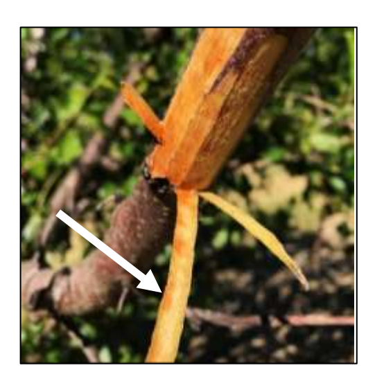
Photo 2 & 3. Select patches of trees in this orchard show the extensive dieback (photo 2) consistent with bacterial canker. The field diagnosis of bacterial canker was supported by the tell-tale signs of flecks (see arrow, photo 3), as well as the fermented/sour-smell associated with the sour sap phase of bacterial canker decline.

Cytospora . Cytospora infections can be found in virtually all mature California prune orchards. Predisposing damage that allows for Cytospora, as well as Botryosphaeria canker infection, include breaking of the bark from sunburn, potassium dieback, bacterial canker, ring nematode, and pruning wounds. Canker infection through pruning wounds is an especially great concern when there is mechanical hedging or topping that make thousands of indiscriminate pruning wounds that are potential entry points for rain-splashed fungal spores. For example, in one orchard that was mechanically boxed in the fall of 2017, Cytospora was subsequently diagnosed during the following 2018 bloom when some trees were not flowering out, except low in the canopy (photo 4). Because Cytospora cankers are perennial and will continue to grow and spread unless they are cut out, one year later during the 2019 bloom, the canker on one tree had spread all the way down to a primary scaffold (photo 5).