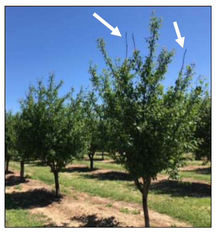
Photo 1. Orchard with branch tip dieback (see arrows) suspected to be from a dormant oil application.

Oil Damage. Some tip dieback at the tops of trees was observed in many orchards this spring. This discrete dieback of upright branch tips occurred in orchards that received a dormant horticultural oil application and is consistent with how oil burn presents (photo 1). Oil was applied to this block during dormancy (2-3 gallons December/January). Although oil can help provide effective control of scale insects, drying weather before application (e.g. a drying north wind) can lead to phytotoxicity "burn" and dieback.