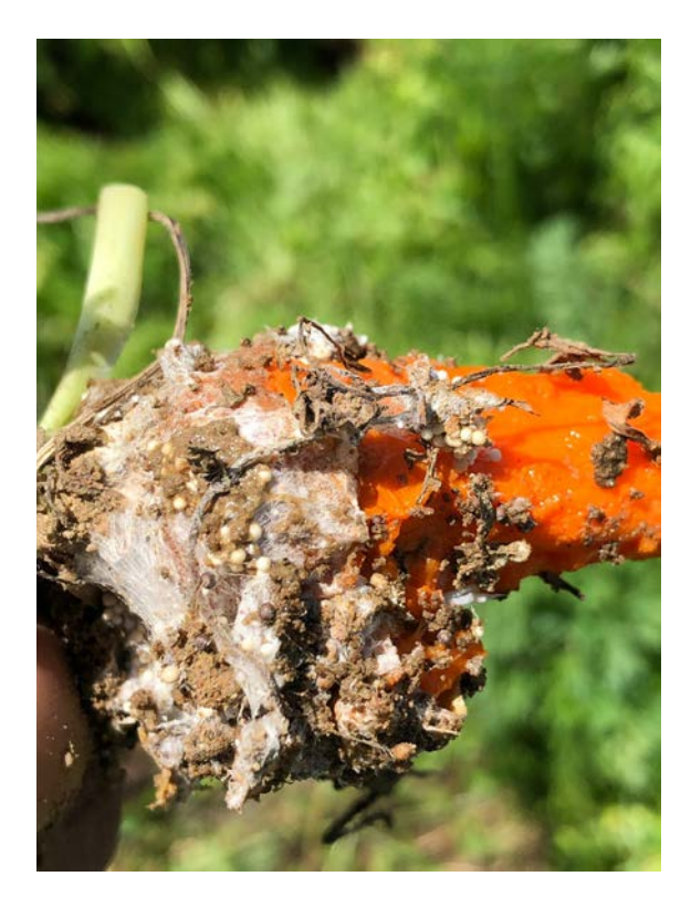
Fig 5. Southern Blight on a carrot root