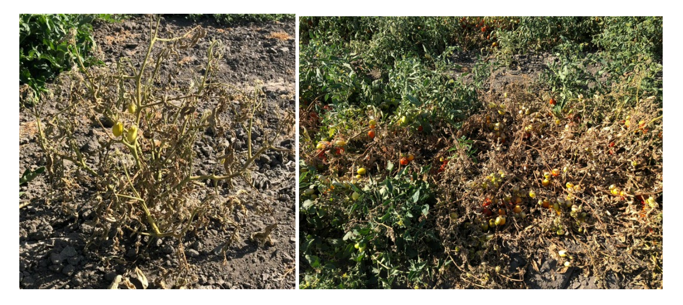
Fig 1. A wilted tomato plant

Southern blight is often not recognized in the field until the plants begin to wilt and it is wide spread in a field. The fungus primarily attacks a plant at the soil line where a brown to black water soaked lesion develops. The lesion develops rapidly and girdles the stem leading to wilting of plants (Figs. 1&2).