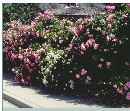
Figure 5. Upright landscape rose varieties such as Pink Simplicity, shown here, are medium to large shrubs.

Roses are often purchased in late winter or early spring as bare-root plants. To maintain plant health prior to sale, these plants should be held in the nursery under cool conditions with their roots kept moist. Packaged plants should also be kept cool because warm temperatures hasten loss of carbohydrate reserves and contribute to gradual desiccation of wood, resulting in difficulty in establishment. After purchase, these plants should be kept shaded and moist and planted into the garden as soon as possible. Plant roses at about the same height they were