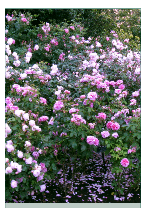
Figure 2. Hybrid teas and grandifloras.

Hybrid teas and grandifloras (Figure 2) were developed primarily for their large, showy flowers. Because of their profuse bloom and disease resistance. the cluster-flowered floribundas (Figure 3) and polyanthas (Figure 4) are more suitable for landscape use than hybrid teas and grandifloras.