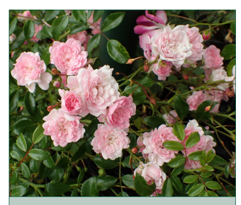
Figure 4. The polyantha rose variety 'The Fairy.'

Landscape roses are available in three approximate growth forms: upright plants, mounding shrub roses, and ground covers. Some examples are listed below, but new cultivars are developed and released on an annual basis.