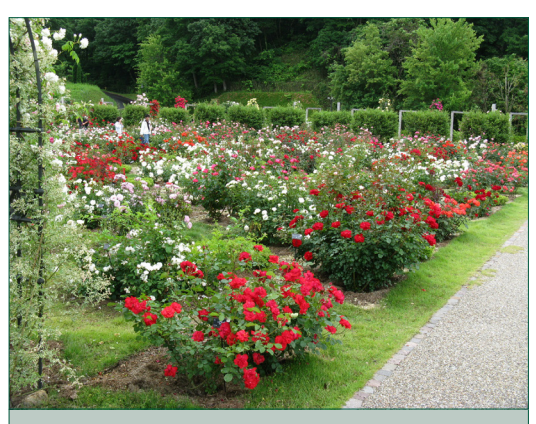
Figure 1. Roses in a traditional garden setting.

Modern roses are classified based on lineage and flowering characteristics.