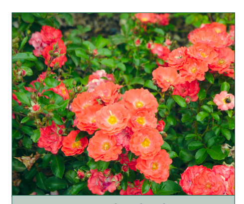
Figure 6. Mounding landscape shrub roses, such as 'Coral Drift,' are more rambling than upright varieties.

canes, and may contribute to spider mite problems. However, overwatering or poorly drained soils may lead to root disease and nutritional deficiencies.