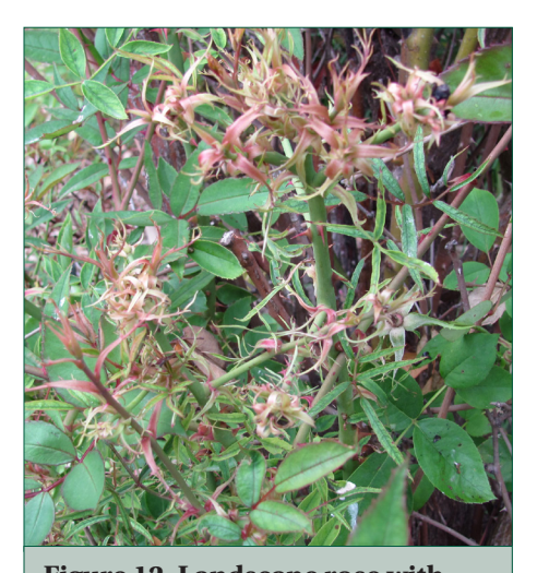
Figure 12. Landscape rose with small, needle-like shoots typical of injury from the herbicide glyphosate.

pendimethalin (Pendulum) were effective in field trials and did not injure roses.