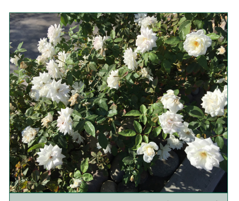
Figure 3. The rose variety 'Iceberg,' a cluster-flowered floribunda.

Hybridizing with floribunda varieties has resulted in the relatively recent development of landscape roses, also called shrub roses, which are cultivars selected specifically for use as flowering shrubs in the landscape (Figures 4, 5, and 6). These varieties have enhanced disease and insect resistance and require less pruning than traditional garden varieties of roses. Planting and care are also easier because thorns are smaller and less numerous than found on traditional varieties. Because petals and spent flowers separate from the stems on their own, deadheading (the removal of old flowers) is not required, though this practice can speed up rebloom for some varieties. In cold-weather areas, the own-root propagation of landscape roses means plants can regenerate true-to-type from roots even if killed to the ground by cold temperatures.