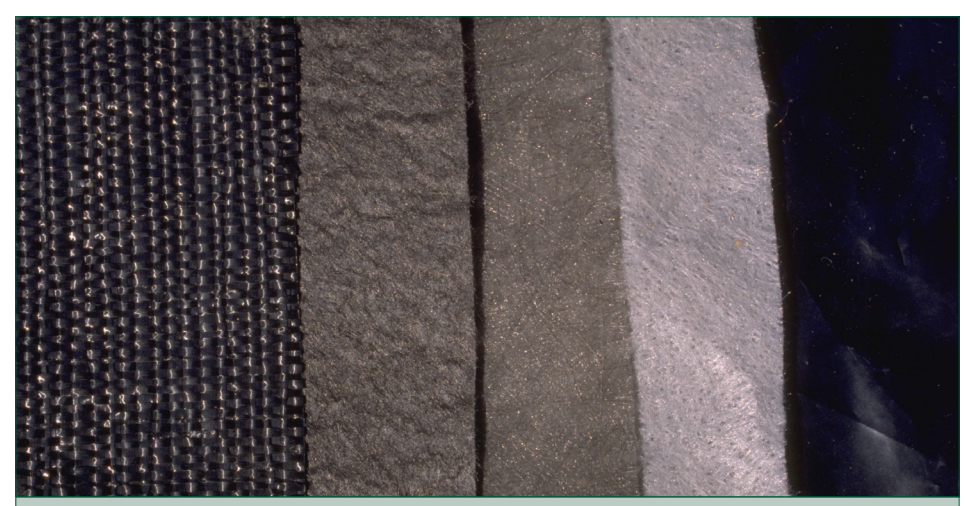
Figure 10. Different types of fabric mulch weed barriers. Woven barriers provide best weed prevention.

In most home gardens, mulches supplemented with regular hand-weeding or rogueing (digging out the entire plant, roots and all) should provide satisfactory weed control. Mechanical