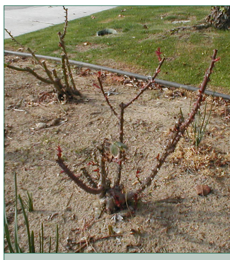
Figure 8. Rose bushes pruned in a vase-shaped configuration.

Removal of more wood results in fewer but larger flowers with longer stems suitable for cut flowers. Less pruning preserves the size of plants and results in a greater number of smaller flowers which can result in a