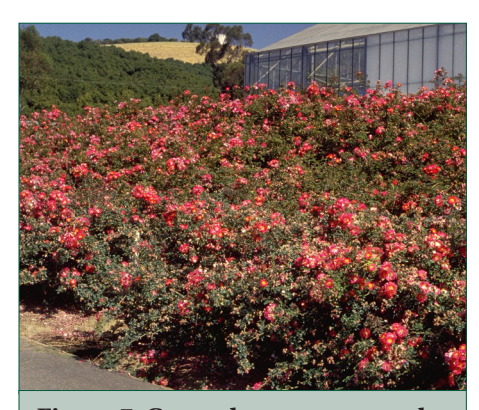
Figure 7. Groundcover roses such as 'Ralph's Creeper,' shown here, are useful for covering banks or walls.

Frequency and duration of irrigation will depend on weather conditions and soil texture. Roses do best when 50% of available water is depleted between irrigations. Checking after irrigation to determine soil moisture status and rate of depletion is helpful in scheduling irrigation.