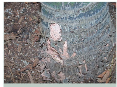
Figure 8. The trunk of this kentia palm has pink rot. Note the pink spore masses.