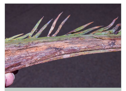
Figure 5. Leaves of this Medjool date palm have symptoms of pink rot on the rachis.