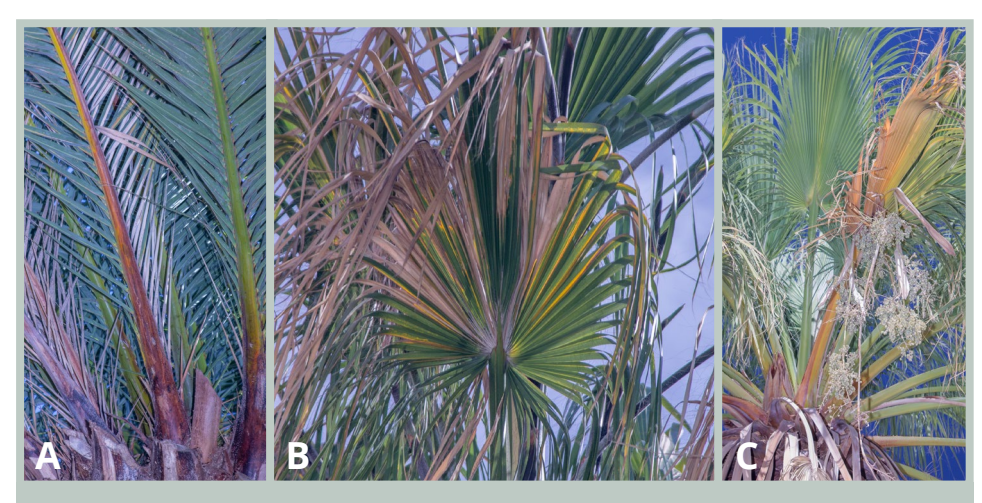
Figure 4. Symptoms of petiole and rachis blight. A: pinnae dead on one side with streaking along the rachis. B: segments of leaf blade yellowed and dying in wedge-shaped pattern. C: reddish-brown streak the length of the petiole.

Symptoms of pink rot are variable and include spotting and rotting on nearly any part of the palm. Symptoms occur on leaf bases, petioles, rachises (Figure 5), blades (Figures 6 and 7), the apical meristem area where leaves are produced, inflorescences (flower stalks), roots, and even the trunk (Figure 8) although this latter occurrence is unconfirmed in many cases. Stunting, distortion, discoloration and even death of new leaves as they emerge from the apical meristem is common (Figures 9 and 10). Pinkish spore masses, from which the disease derives its name, are often present, especially when protected behind overlapping leaf bases or