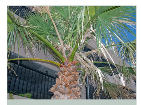
Figure 10. In this California fan palm pink rot has killed some of the newly emerging leaves. Note the diamond scale, which likely stressed this palm, making it susceptible to pink rot.