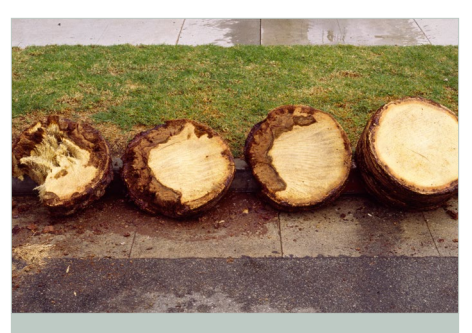
Figure 13. These transverse sections from a Canary Island date palm trunk show, from right to left, how infection and decay from sudden crown drop (darkened tissue) regress away from the initial point of infection.

of chain saws to prune leaves and to shape and sculpt "pineapples," the ball-like mass of persistent leaf bases just below the leaves, and especially to "skin" or "peel" trunks of old, persistent leaf bases can create gaping wounds that facilitate pathogen entry and onset of decay. Thus, annual screening or testing is essential for detection.