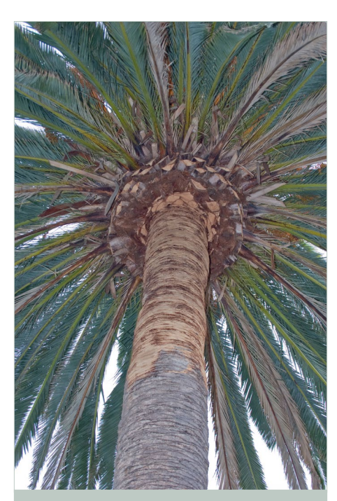
Figure 14. Sculpting "pineapples" and skinning trunks below the leaves can cause Canary Island date palms to be susceptible to sudden crown drop.

for the pathogen, the typical position of such pruning, high up on the trunk where tissues have yet to attain anywhere near their maximum strength and resistance to decay, increases the likelihood of decay and crown drop.