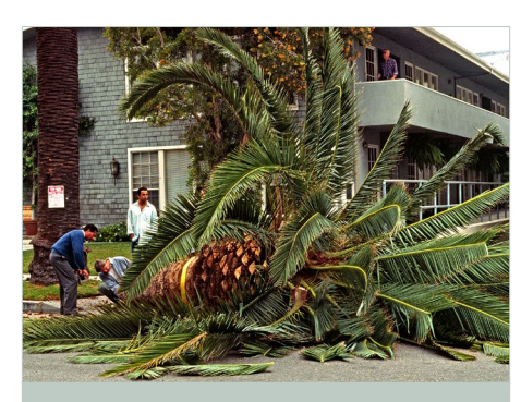
Figure 12. Sudden crown drop caused the entire crown, including the canopy of leaves and upper part of the trunk to suddenly to fall from this Canary Island date palm.

Although cultural factors, including drought stress, may promote disease development and severity in Canary Island date palms, the extensive use