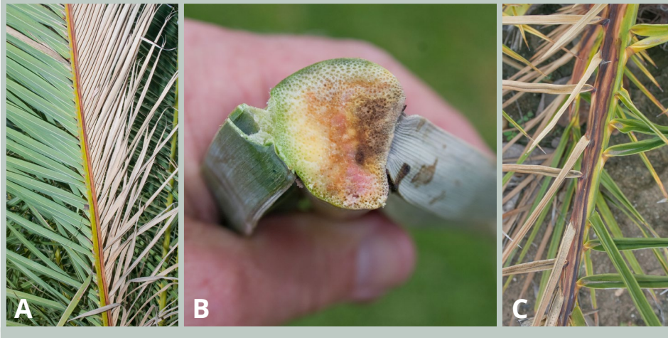
Figure 3. Symptoms of Fusarium wilt. A: pinnae brown on one side. B: reddish-brown internal petiole tissues with a slight pinkish blush. C: dark streaking along the rachis or petiole.

Use plastic or wooden barriers to contain sawdust and other diseased plant parts during removal. After collecting and securely bagging all debris, prepare removed palms for incineration or removal to a landfill; do not use a waste recycling program. Removing the soil will likely not prevent the spread of Fusarium wilt because just one small piece of infected root is all that is necessary to infect a newly planted palm.