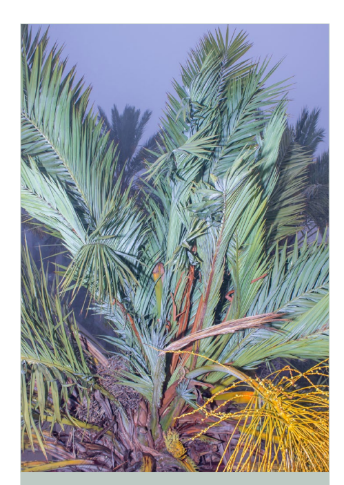
Figure 9. Stunting and distortion of new leaves emerging from the apical meristem of this newly transplanted Medjool date palm is characteristic of pink rot.