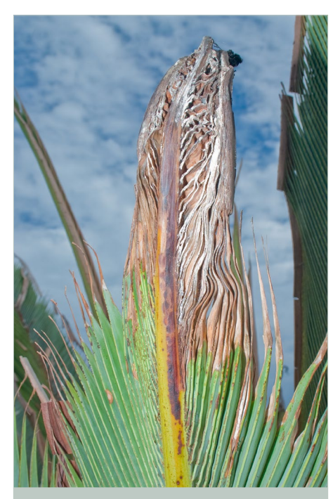
Figure 7. A newly emerging leaf of this Canary Island date palm has symptoms of pink rot.