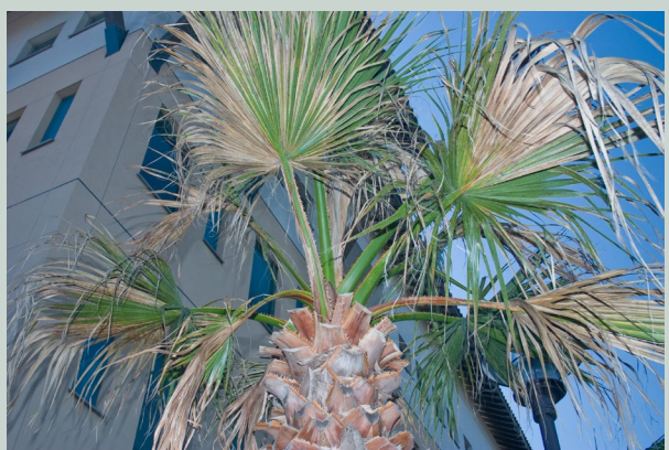
Figure 1. Palm diseases often lead to a reduced leaf canopy. From top left: California fan palm with diamond scale; Canary island date palm with Fusarium wilt; California fan palm with petiole blight.