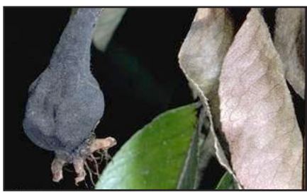
Figure 2. Blackened fruit is typical of fire blight infection.