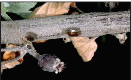
Figure 1. Bacterial ooze on a twig with fire blight infection.

Open flowers are the most common infection sites (Fig. 3) and remain susceptible until petal fall. Infected flowers and flower stems wilt and turn black on pear trees and brown on apple trees. Fire blight infections might be localized, affecting only the flowers or flower clusters, or they might extend into the twigs and branches, causing small shoots to wilt (Fig. 4) and form a crook at the end of each infected shoot. Succulent tissues of shoots and water sprouts (root suckers) also are subject to infection. Dead, blackened leaves and fruit cling to branches throughout the sea-