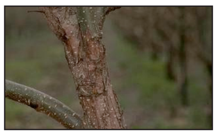
Figure 6. Brown cracked bark covers an overwintering fire blight canker.

into the wood surrounding overwintered cankers that have become active in spring. If the bark is cut away from the edge of an active canker, reddish flecking can be seen in the wood adjacent to the canker margin. This flecking represents new infections the bacteria cause as they invade healthy wood. As the canker expands, the infected wood dies, turns brown, and dries out; areas of dead tissue become sunken, and cracks often develop in the bark at the edges of the canker (Fig. 6). The pathogen