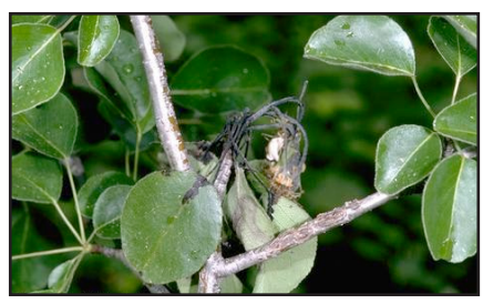
Figure 3. Flower clusters infected with fire blight bacteria.

son, giving the tree a scorched appearance, hence the name "fire blight." Infections can extend into scaffold limbs, trunks, or root systems and can kill highly susceptible hosts. Less susceptible varieties might be severely disfigured. Once infected, the plant will harbor the pathogen indefinitely.