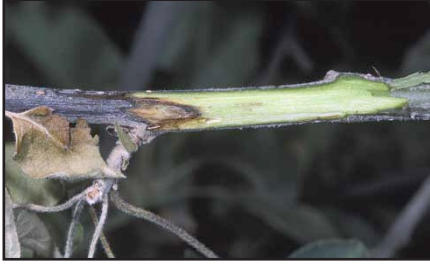
Figure 8. Fire blight canker on apple shoot with bark cut away to show healthy tissues. This branch and the one to which it is attached should be removed.

Ohlendorf, B. 1999. Integrated Pest Management for Apples and Pears. 2nd ed. Oakland: Univ. Calif. Agric. Nat. Res. Publ. 3340. ◆