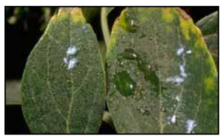
Figure 5. Honeydew produced by the hackberry woolly aphid.