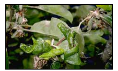
Figure 6. Leaf curling caused by rosy apple aphid.

from a tree. This type of monitoring is of particular interest where there is a low tolerance for dripping honeydew, such as in groups of trees along city streets or in parks and for tall trees where aphid colonies may be located too high to detect. (See Pests of Landscape Trees and Shrubs in References for more details.)