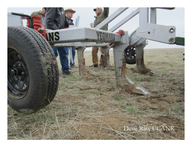
Detail of Yeoman's plow from UCCE workshop in December 2015 in San Luis Obispo. Shanks are long, thin and when operated have limited soil disturbance.

USDA. This relationship is allowing us to trial some new forage species that were initially developed in Utah, to determine their vigor and potential usefulness on the Central Coast of California. We are most excited about "forage kochia" (Kochia prostrata), which has been shown to increase forage nutritional value, carrying capacity, and livestock performance on rangelands throughout the semiarid West. It is a sub-shrub-not a grass-that is quite palatable to cattle. Furthermore, because of its later-season growing habit, it serves as an excellent buffer from wildfires because it stays greener longer through fire season. Royce and I have three trial location in San Luis Obispo and Ventura Counties, and our plan is to monitor germination, establishment, biomass production, and palatability to livestock. We should have more to report Spring 2020.