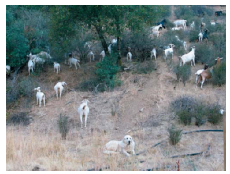
Figure 1. Goats grazing brush with livestock guardian dog (from Nader et al., 2007)