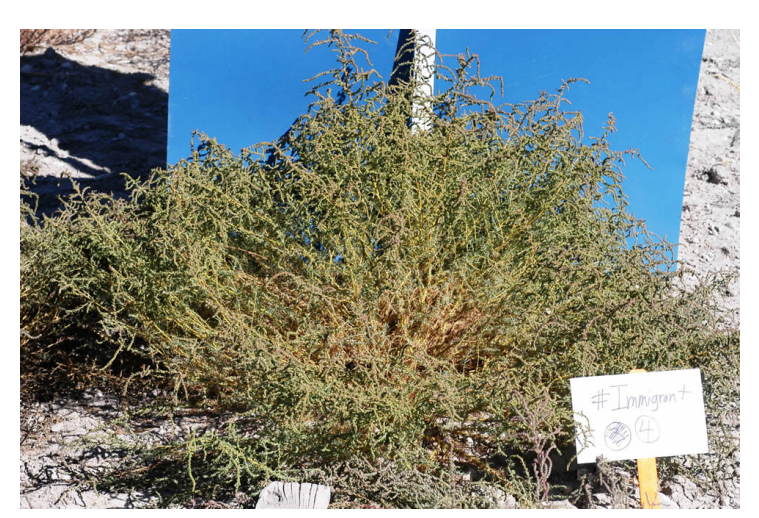
"Immigrant" variety of forage kochia, developed at the Plant Materials Lab in Utah.