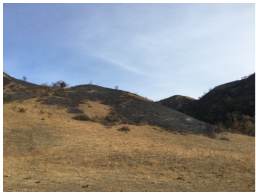
Figure 2. Ranch outside of Ojai Valley that burned during the Thomas Fire, December 2017. Note areas of grazed grassland that remained <u>unburned</u> and areas of shrubland that burned at high intensity.

Furthermore, as a state we should consider how traditional grazing might be expanded to further reduce fuel loading. As one example, we might encourage again grazing in our National Forests, which have seen a precipitous decline in stocking rates over the last sixty years. Fully half of the one hundred allotments in the Los Padres National Forest in southern California. for example, representing ~400,000 acres, remain empty (largely due to the bureaucratic hurdles of complying with NEPA-the National Environmental Policy Act; as an aside, if Congress and the US Forest Service could figure out how to streamline NEPA's environmental review process in a way that would still comply with the spirit of the Act, hundreds of allotment permits could be reissued and hundreds of thousands of acres could again be treated with regular cattle, sheep, and goat grazing, which would substantially improve the state's fuel loading).