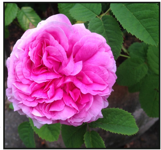
'Duchesse de Rohan'

Because most general not carry these classes of roses, the public is by and large unaware of them. Many of them can be bought from Greenmantle Nursery, Burlington Rose Nursery in Visalia and