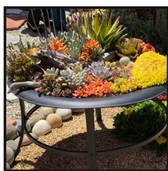
Fire Pit Succulent Garden

In my limited research, I found multiple causes of fasciation including hormonal changes, bacterial or fungal infection, or genetic mutation. Although intentional fasciation has been attempted, experimentation