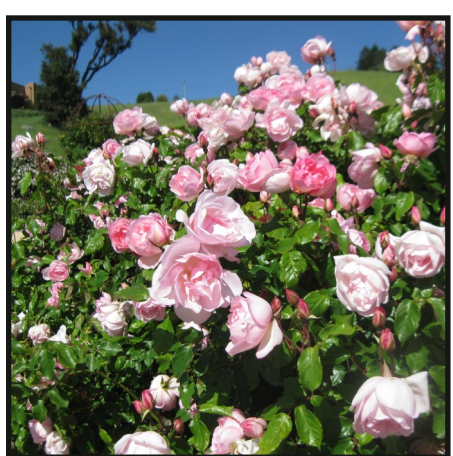
'Duchesse de Brabant'

Yes, Hybrid Teas and Floribundas as a whole require water water water and frequent fertilizer and annual pruning and special care when prone to disease and pests, as many of them are. Shrub roses, which have varied parentage, unlike the twenty or so other major classes of cultivated roses—like those of David Austin's English group—vary their requirements. Yes, they can be labor-intensive. In fact, I know several rose growers who plant and fuss with Hybrid Teas and Floribundas primarily to exhibit them at shows and then eight or ten years later remove them because their productivity declines and so replace them with newer roses.