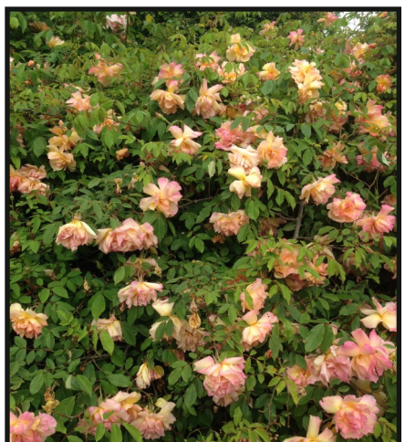
'Fortune's Double Yellow' Covering a Tree