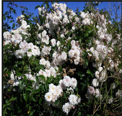
Skagg's Island Noisette

But before we consider a few of them, understand that after these plants have been established (usually a year or two after planting), the Tea roses, the Chinas, and the Noisettes are drought tolerant. That does not mean never to water them. An occasional deep soaking goes a long way. Mulch three or four inches deep around the base retains moisture. Constant winds will dry out any woody plant, so do irrigate them if the winds have been unrelenting for days. And as a whole, those old roses—and here I include the Portland class—do not require fertilizer,