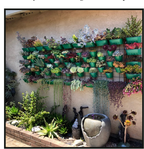
Hanging Succulent Garden

I needed to learn more about this fasciation process and how it would occur in a normal plant. As is usual in many plant processes, there are special terms used to describe this phenomenon. Fasciation is the process whereby the meristem tissue in a normal plant becomes directed to form plant tissue in a very different manner. In general, the stem of the mature plant flattens out with new growth emanating from the top edge of the newly formed wedge. Normal apical dominance gives way