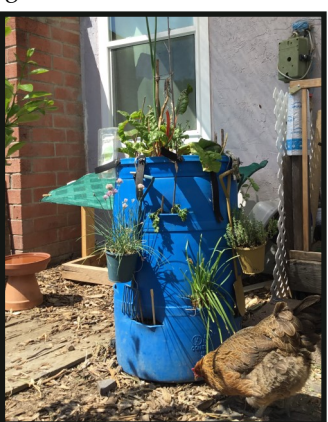
Recycled 50-gallon barrel

Now, let's talk about the second category—plants that cannot climb or have shorter stems—the shrubby plants. To grow these plants vertically, a vertical structure is needed. These structures can be as simple as hanging a number of pots to a wall or setting a recycled pallet upright, or as elaborate as a sophisticated wall growing system. The main idea is to grow each plant off the ground.