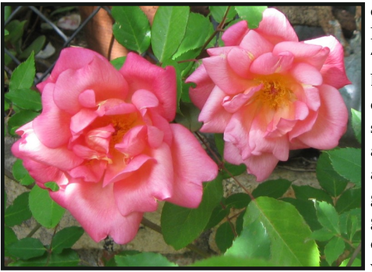
'Comtesse du Cayla

(Continued from Page 5— Undemanding Roses)