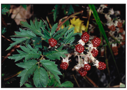
Figure 1. Cutleaf blackberry.

Many animal species feed on wild blackberries; consequently, seeds spread easily from one area to another in animal droppings. Wild blackberry seeds have a hard seed coat and can remain dormant for an extended period. Once seeds germinate and grow and the plants become established, expansion of the thicket is almost entirely a result of vegetative growth from rhizomes. Over time a single plant can cover a very large area.