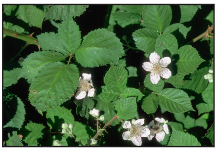
Figure 2. Himalaya blackberry.