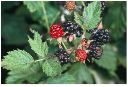
Figure 4. California blackberry.