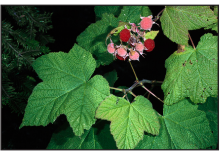
Figure 3. Thimbleberry.