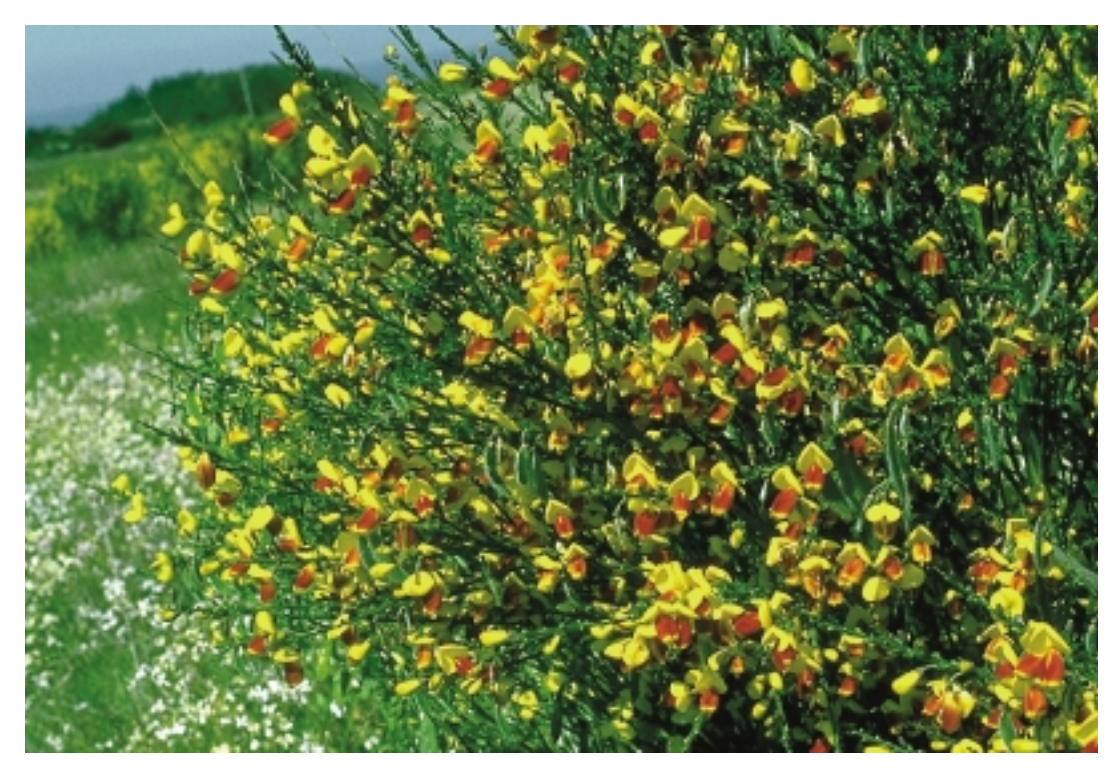
Figure 1. Mature scotch broom.

produced in spring, are often lost during the dry summer months or other periods of stress. Plants may be leafless for most of the year (Munz and Keck 1973).