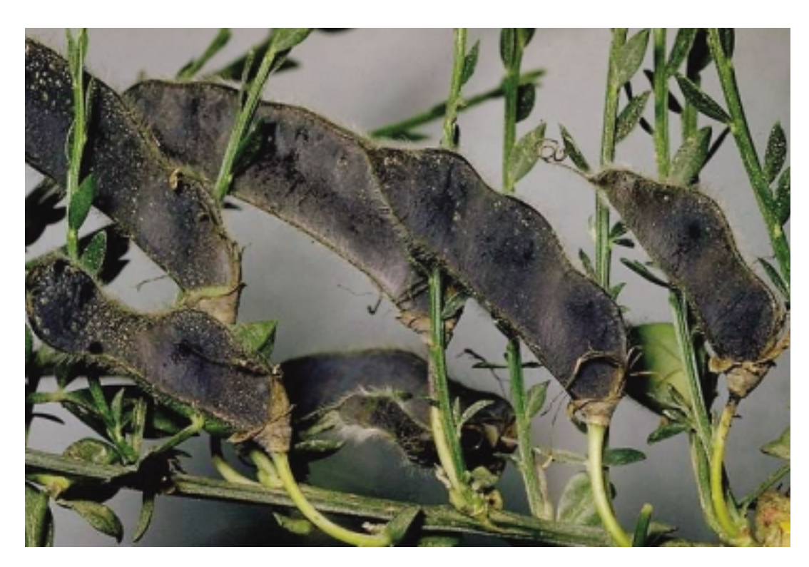
Figure 2. Scotch broom seed pod. Credit : Charles Webber. © 1998 California Academy of Sciences. Reprinted with permission.