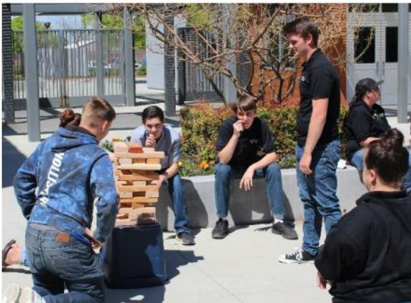
Tehachapi Mtn 4-H