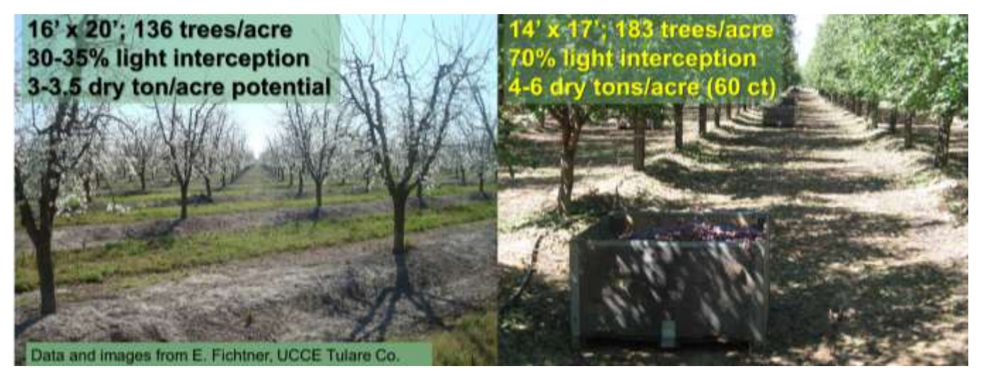
Figure 3. Two orchards with contrasting spacing, light interception and yield potential.