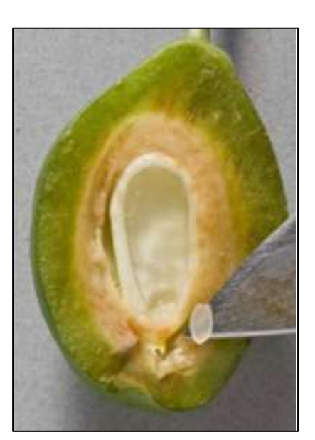
Figure 1. Extraction of the endosperm on a developing prune.

This year, processors desire large A screen fruit. To keep your crop from falling through the sizer, you need to do some legwork, estimate your fruit set, and thin if needed. Thinning should occur roughly around the same time as 'reference date', or the point at which 80 to 90% of the fruit have a visible endosperm. The endosperm, a clear gel-like glob, will be found in the seed on the blossom end of the prune (Figure 1) and is solid enough to be removed with a knife point. Typically, the reference date occurs in late April or early May, approximately one week after the pit tip begins to harden. The earlier thinning is done, the greater effect it will have on final fruit size at harvest. However, if you thin too early, you may damage the trees without removing the desired number of fruit.