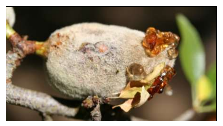
Photo 1. Anthracnose lesions and gumming on almond hull.

More detail on identification and management of the potential causes of hull gummosis, shell, and kernel gumming can be found in the UC Statewide IPM Programs Pest management Guidelines for Almonds (<u>ipm.ucanr.edu/PMG/selectnewpest.almonds.html</u>), and in multiple posts at the Sacramento Valley Orchard Source Website (<u>http://www.sacvalleyorcards.com/</u>) and the Almond Doctor Blog (<u>thealmonddoctor.com/</u>).