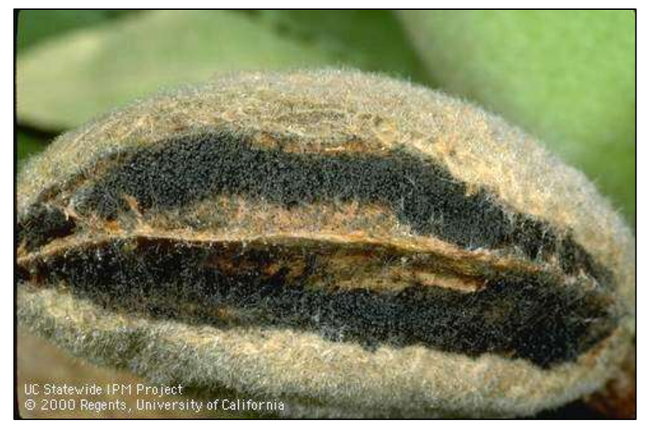
Figure 2. Hull rot caused by Rhizopus stolonifer.