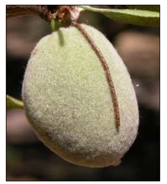
Photo 3. Leaffooted bug egg mass on almond.

Photo 2. (A) Necrotic lesions inside almond hull caused by bacterial spot infection. (B) Bacterial spot gumming on almond hulls. (C) Necrotic bacterial spot foliar symptoms.