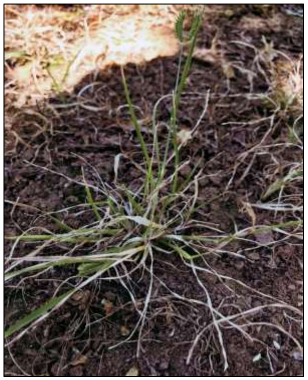
Figure 2. Threespike goosegrass 3 weeks after a 2 qt/A Roundup Weathermax treatment. Plant exhibits regrowth and ability to flower.