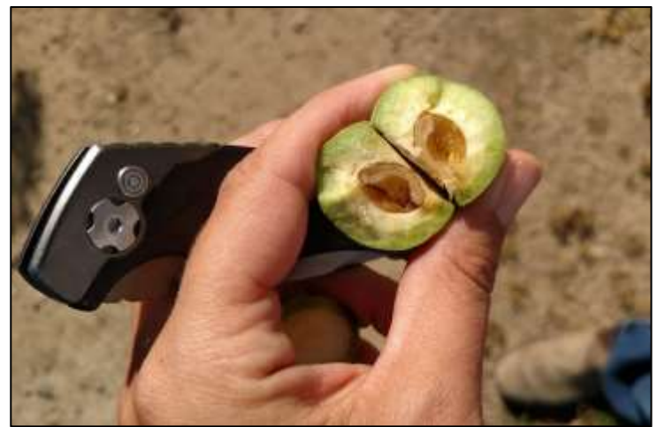
Photo 5. Boron deficiency causes gummy almond kernels.