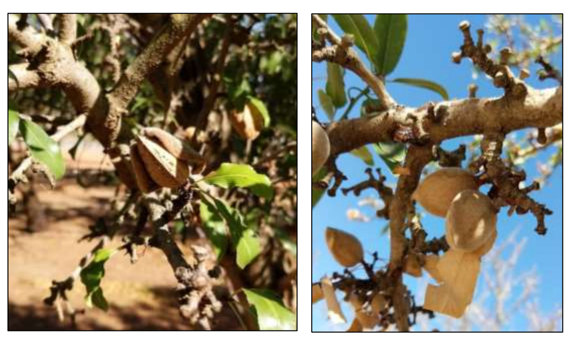
Figure 4. Symptoms of hull rot caused by Phomopsis differ by cultivar. These photos, from the same orchard, show fully split nuts on cv. Mission (left), and unsplit nuts on cv. Butte (right). Sticktights from both trees tested positive for Phomopsis .