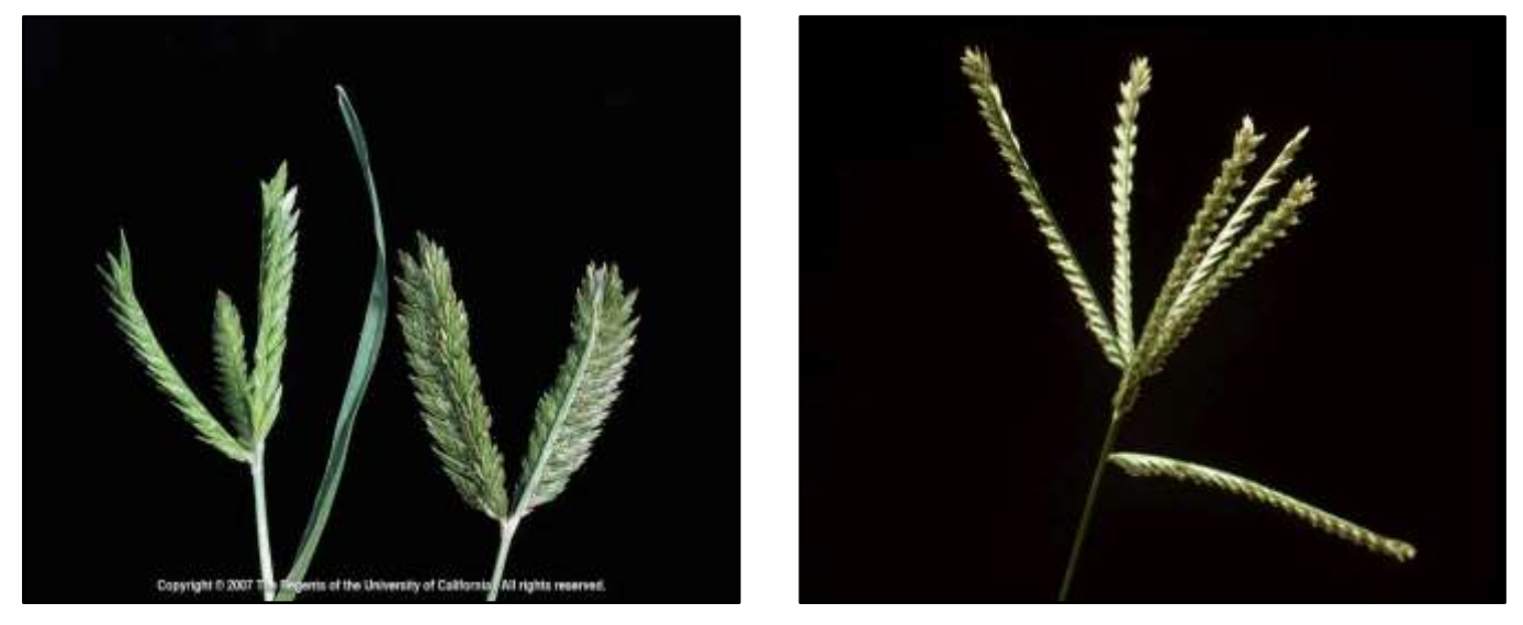
Figure 1. Digitate inflorescence – or spike – comparison. Threespike goosegrass (E. tristachya) on the left, goosegrass (E. indica) on the right.