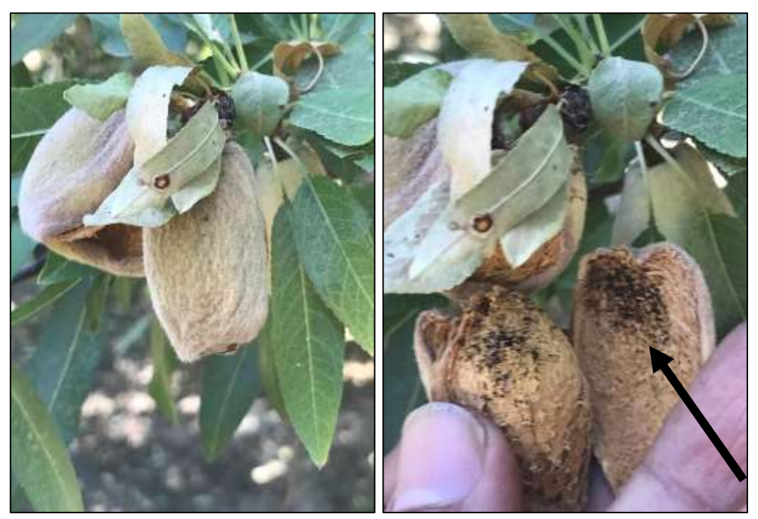
Figure 3. Symptoms of hull rot caused by Aspergillus niger . Flat, jet-black spores are present in-between the shell and the hull.