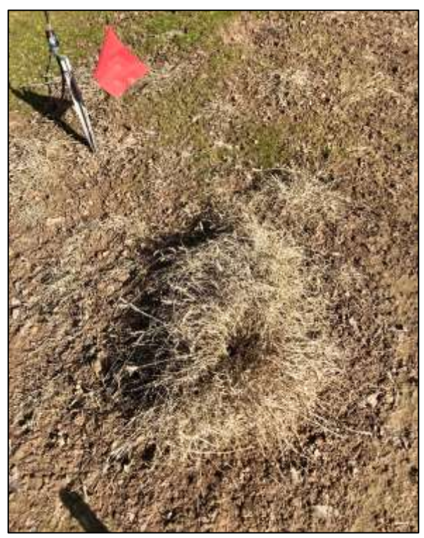
Figure 3. Heavily tillered threespike goosegrass 5 weeks after Fusilade treatment. Full necrosis achieved.