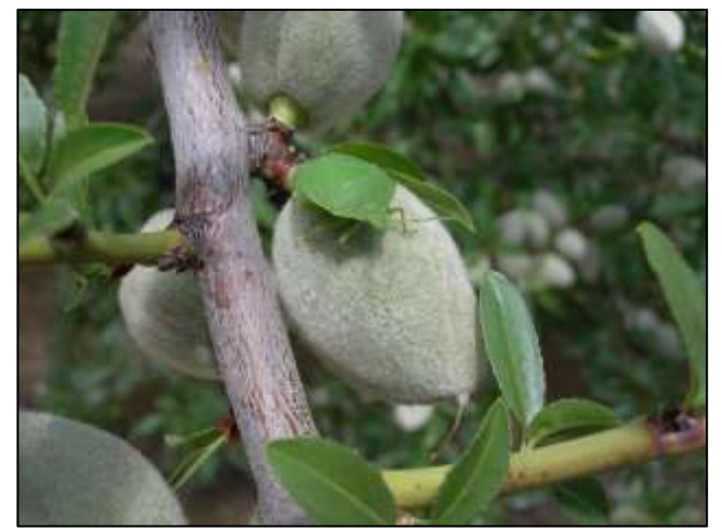
Photo 4. Adult green stink bug on almond.