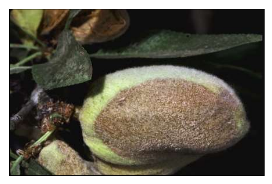
Figure 1. Hull rot caused by Monilinia causes a tan lesion on the outside of the hull. This symptom is hard to see once hulls dry.