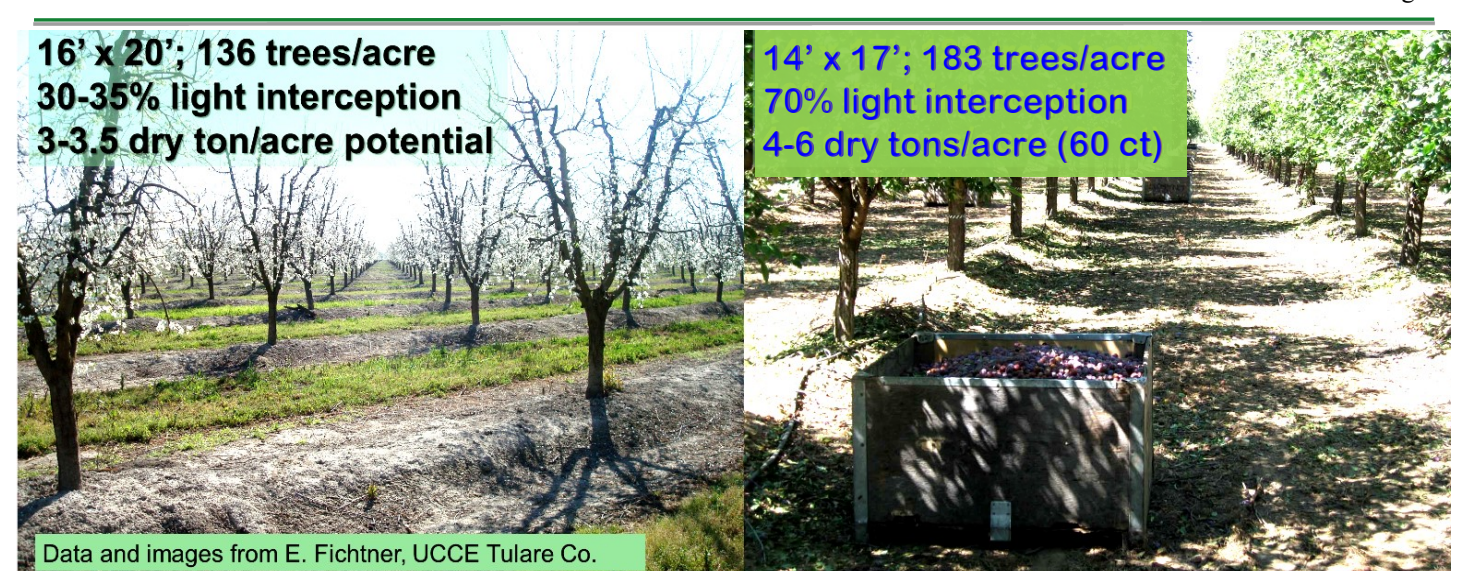
Figure 3 . Two orchards with contrasting spacing, light interception and yield potential.