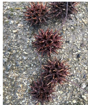
Nuisance gumballs from a liquid amber tree.

A deciduous tree native to warm temperate areas of eastern North America and tropical mountain regions of Mexico and Central America. It can go by a variety of common names: American storax, hazel pine, bilsted, redgum, satin-walnut, star-leaved gum, or alligatorwood. It is pyramidal in growth and can reach a height of 100 feet or more and spread as wide as 50 feet, though commonly less in spread. It has become a popular ornamental tree in temperate climates. The best-selling point for the tree is the fall foliage of star shaped five-lobed leaves which turn from yellow to crimson. The tree has proven to be tolerant of a wide range of soils and pH levels. The major drawback is the very abundant, inch diameter, spiny fruit which remain on the tree and drop off all winter causing a nuisance to be raked out of your lawn or garden. There is a solution for this problem. You can plant Liquidambar styraciflua 'Rotundiloba' which is a sterile, non-fruiting cultivar that does not produce the spiky "gumballs."