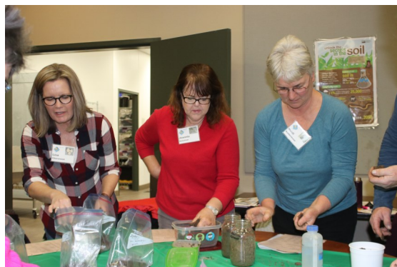
Master Gardener Trainees ribboning soil

I hope you find this edition of Garden Notes full of helpful gardening info and tips! Happy Gardening!