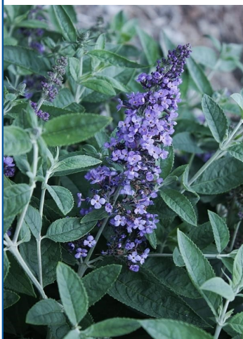
Blue heaven' Buddleia hybrid