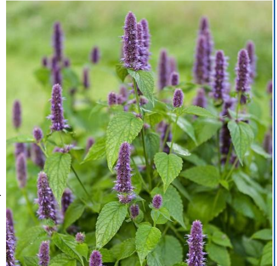
Annis hyssop plant

Our hope is that you will enjoy exploring the world of herbs as much as we do. If you have questions or comments, or would like more information about Herbs you can email us at: anrmgsanjoaquin@ucanr.edu .