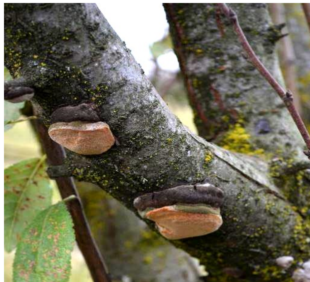
Figure 1. Fruiting bodies of P. tuberculosus

On several instances during our survey work, Trichoderma spp. were isolated from Phellinus decay. Trichoderma spp. are often found colonizing Phellinus fruiting bodies (Figure 3). Trichoderma spp. are free-living fungi, antagonistic to other fungi, and are also myco-parasites, meaning they can compete with and consume other fungi. Trichoderma spp. have been shown to be effective bio-control agents and many commercial products are available for the control of