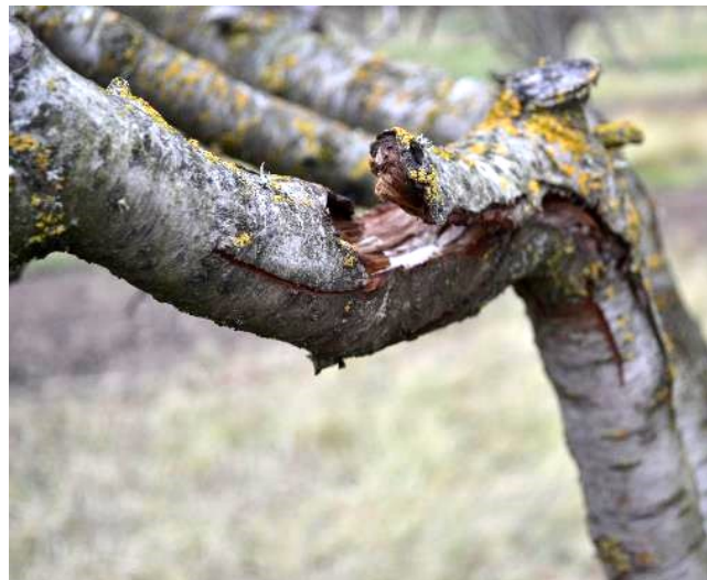
Figure 2. Broken limb in young orchard caused by P. tuberculosus .

These experiments are currently being repeated and field trials are planned for 2019.