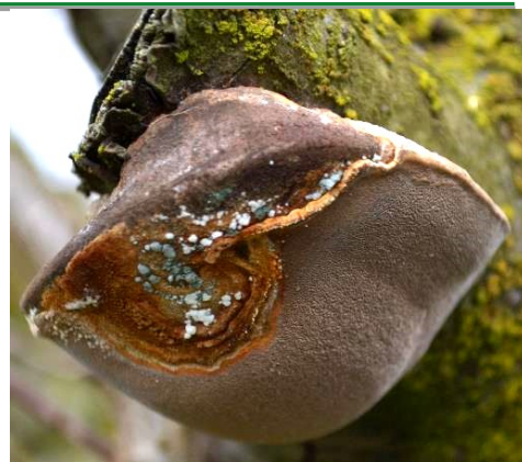
Figure 3. Trichoderma sp. parasitizing P. tuberculosus fruiting body.

We are confident that through a combination of new varieties, bio-control products, and conscientious pruning practices, the impact of Phellinus on prune orchard productivity and longevity can be mitigated.