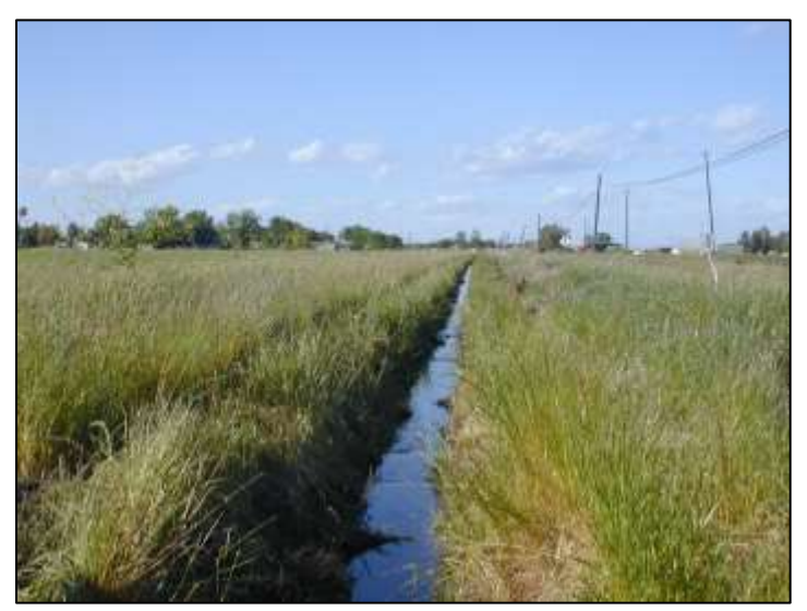
Grass filter strip along a roadside, Yolo County