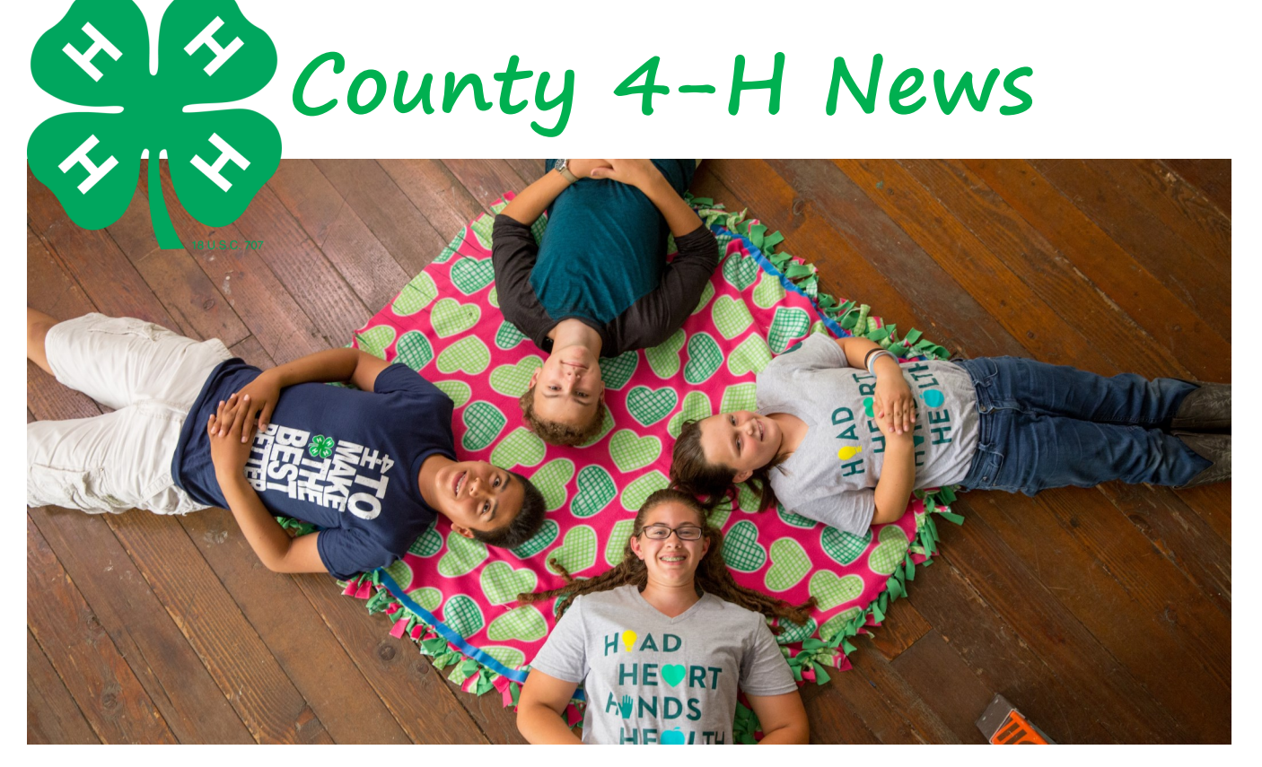
Want to get more involved? Join Tuolumne Council on March 6, 2019. County council meetings are important for county wide decisions. Come and represent your club in person or virtually from home! All leaders and teen members have equal voting rights. We need attendance from all clubs to have a successful year! We meet each month at the UCCE office at 52 N. Washington St. Sonora CA