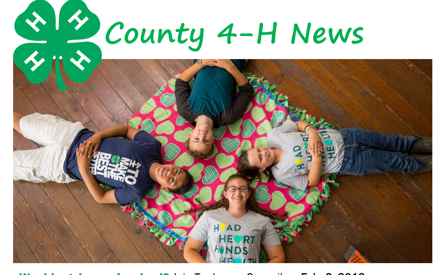
Want to get more involved? Join Tuolumne Council on Feb. 6, 2019 .

County council meetings are important for county wide decisions. Come and represent your club in person or virtually from home! All leaders and teen members have equal voting rights. We need attendance from all clubs to have a successful year! We meet each month at the UCCE office at 52 N. Washington St. Sonora CA