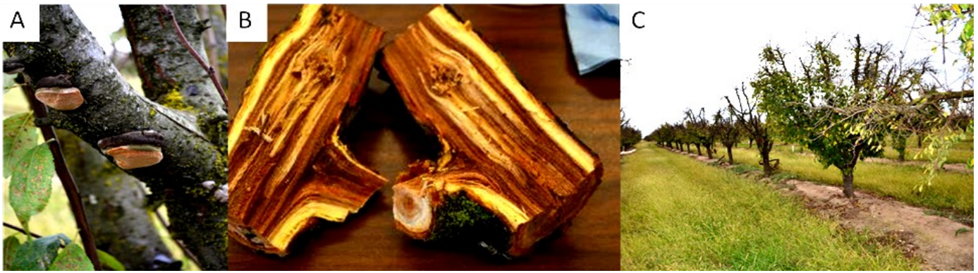
Figure 3. Scaffold: The heart rot of Phellinus tuberculosus , which infects through pruning wounds, is major disease in prune production (A-C). Although Phellinus spp. can infect almond, it is not widely observed, perhaps because there is less pruning performed than in prune production. Much like Ganoderma spp. infections, conks are the only sign visible on the exterior (A). In prune production, heart rot infections often break scaffolds during the shaking process at harvest.