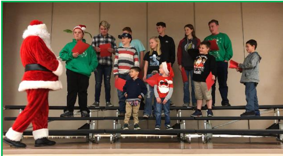
Santa surprising Premier 4-H Club at their Christmas party