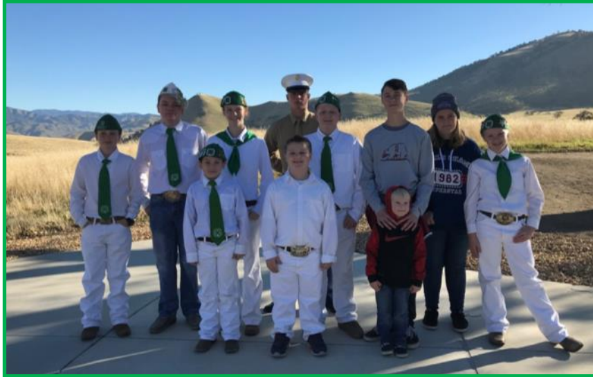
Premier 4-H Club members participating in the wreath laying event at the National Cemetery