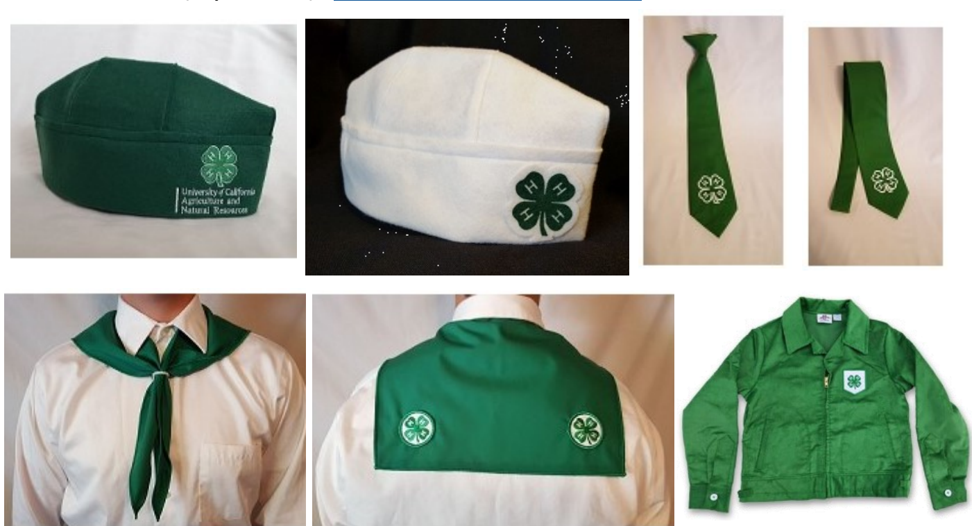
TIP: Start shopping for your white pants NOW. Ask club leaders about white exchanges and when uniform hat, tie, and or scarf can be ordered

Show Jacket (Optional): <a href="http://showjacket.com">http://showjacket.com</a>