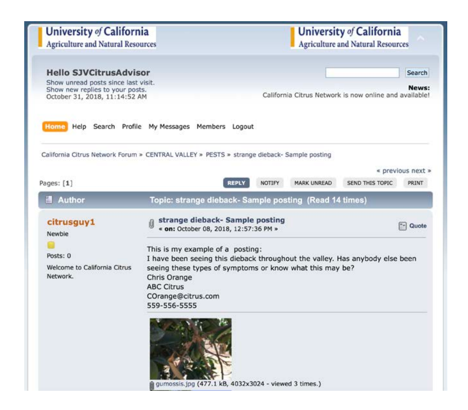
Figure 2 . Example posting of citrusguy1 including text and a picture of the issue he is observing in the field.

The utility of this forum is that a person has the ability to make an observation in the field, snap a couple of pictures of what he/she sees, and easily post this information to the forum where the citrus community at large could view and respond to start a thread on the topic. This could be done out in the field using a smart phone or tablet or from an office computer at the user's leisure. The success of this network will rely on individuals in the citrus industry to utilize this new important tool. The site is up and running but is certainly in the beta-testing phase. Therefore, having individuals using the site and reporting any problems or making suggestions on making it better is highly desirable. If the forum is successful, support will be sought to produce an app for cellular phones to make the process easier than a web-based forum. For further information or ideas of how this site can be improved, please contact Greg W. Douhan, SJV Citrus Advisor, UCCE, Tulare, California: gdouhan@ucanr.edu