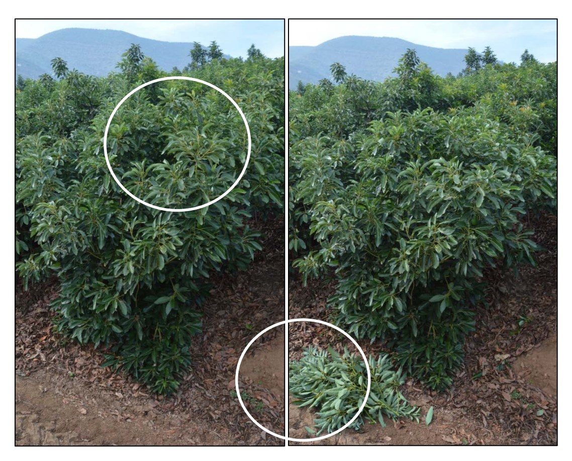
Figure 3. Post-harvest hand pruning of lateral shoot in a HDP orchard (Mexicola x Hass; 7.5x7.5; 700 hundred trees per acre) to keep tree height under control and limit shading effect.