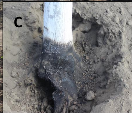
Figure 4. An air spade can be used to expose the crown of the tree prior to gall excision (A) . The gall can be cut off (B) and the resulting wound may be cauterized by flaming with a propane torch. Excessive heat may be both unsightly, leaving charred tissue and resulting in damage to the cambium (C) .