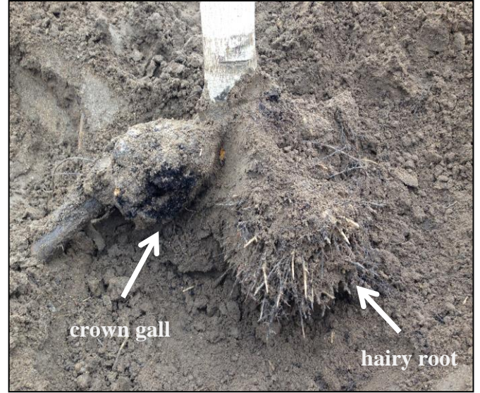
Figure 1. A) Crown gall at the crown of a 'Paradox' walnut rootstock; B) Tree affected by both crown gall and hairy root.