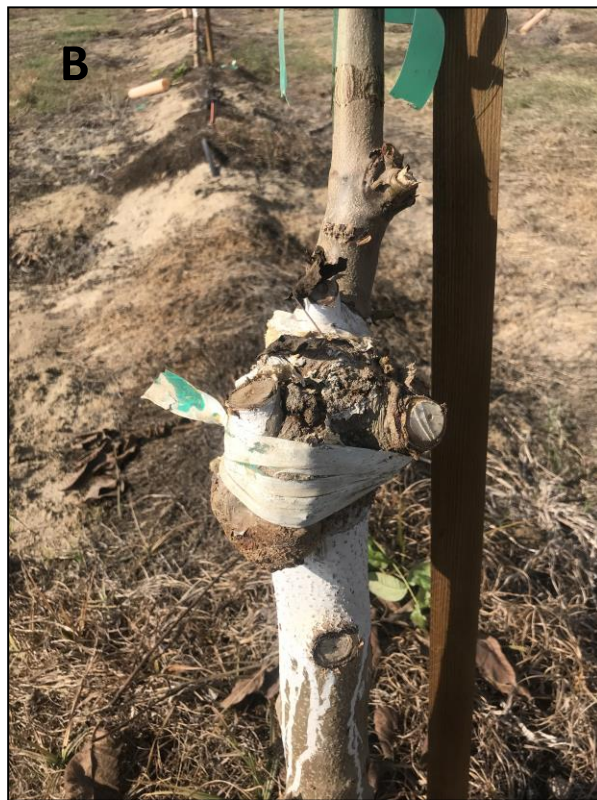
Figure 3. These clonal ‘Paradox’ rootstocks were planted in an orchard formerly containing crown gall-infected cherry. The trees were field grafted in the second leaf and exhibited excess suckering (A) on the rootstock. As these suckers were cut, loppers occasionally touched infested soil, suggesting that inoculum causing galls at the graft union (B) may have originated within the orchard.