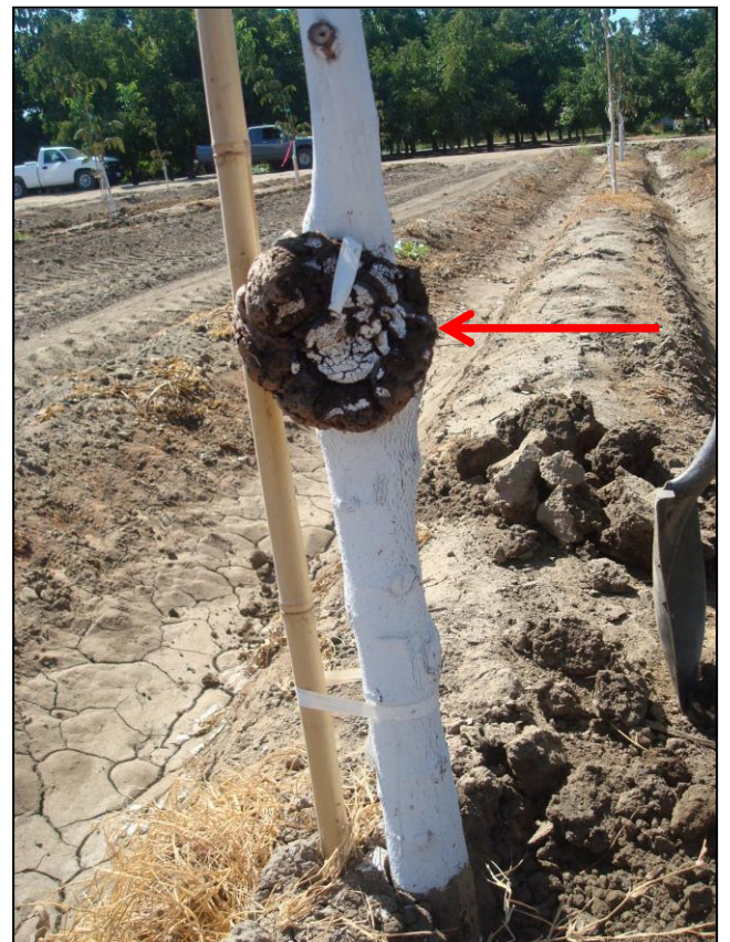
Figure 2. Crown gall above the graft union (A) and at the graft union (B) . Red arrows indicate location of graft union.