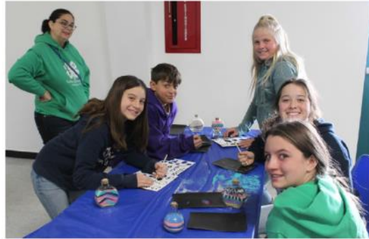
Having fun with Arts & Crafts