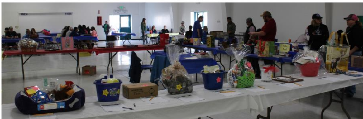
The Silent Auction had something for everyone