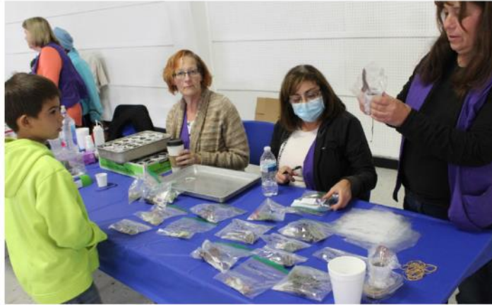
Violet Ladies teaching us about Plant Science