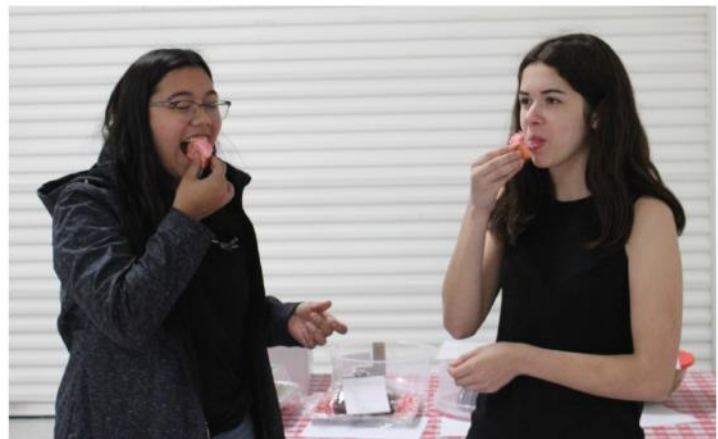
Bake Day Judges loving their job.