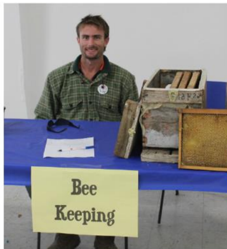
A new Beekeeping Project?