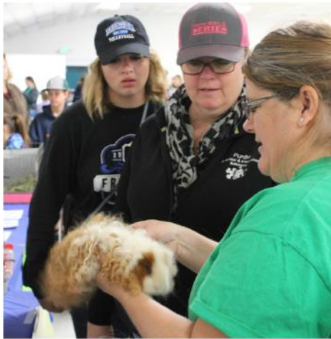
Cavies have good hair days and bad hair days.