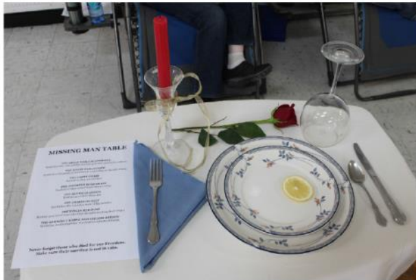
A tribute to Veteran's Day: The missing man table