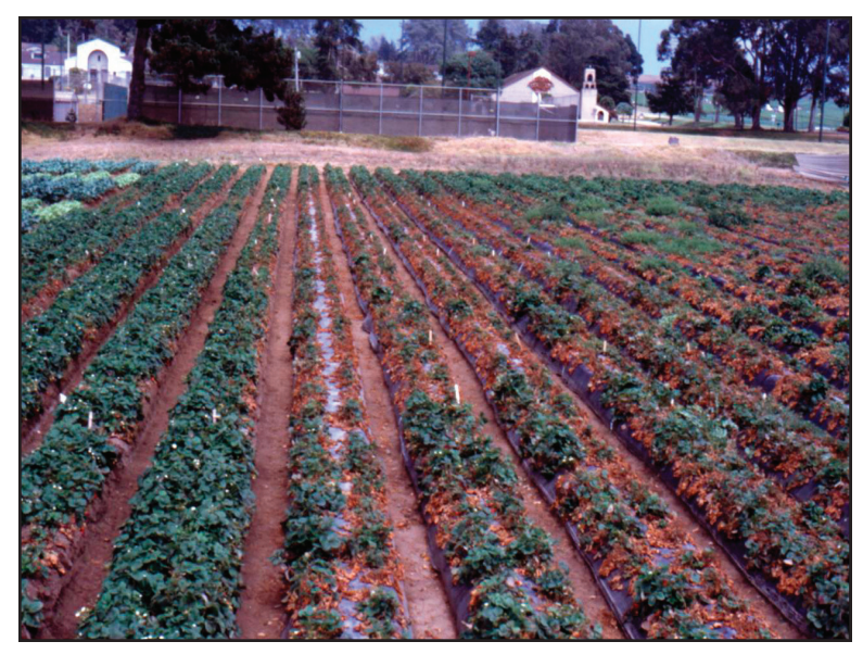
Figure 3. Premature death of strawberry plants in June caused by Verticillium wilt in an unfumigated, experimental field.

Strains of V. dahliae that cause disease on