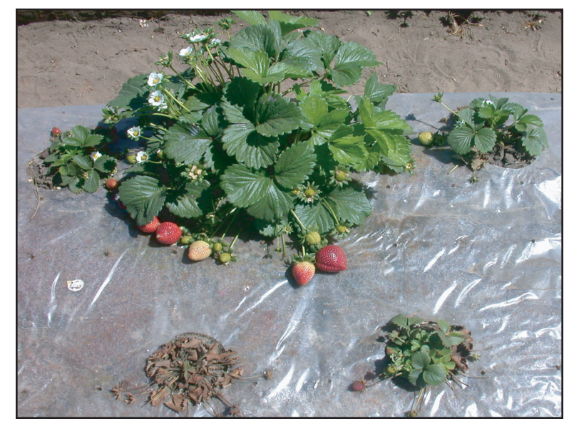
Figure 1. All five plants pictured here were transplanted into a fruit production field on the same date. Four plants were infected by Verticillium dahliae and became severely stunted. The healthy appearing plant was not infected.

The development of Verticillium wilt can be strongly influenced by the timing of infection and cultivar susceptibility. Where infection occurs very early in the season and/or the affected cultivar is highly susceptible, plants may be severely stunted (Figure 1). Disease symptoms may be much slower to develop in less susceptible cultivars and where infection occurs later in the season. Late infections are typical of low inoculum levels, because the root system may develop extensively before it encounters the pathogen in soil. In these cases, plants often become quite large and may be indistinguishable from healthy plants through much of the season. Verticillium wilt may then cause limited dieback and some reduction in yield or may kill the affected plant entirely (Figures 2 and 3). Verticillium wilt does not cause visible