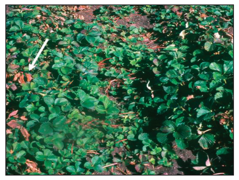
Figure 6. An experimental nursery production field in which some mother plants (e.g., arrow) are showing symptoms of Verticillium wilt. By the end of the season, these symptomatic plants may be completely overgrown by healthy daughter plants.

Although strawberry cultivars differ in their susceptibility to Verticillium wilt, none are sufficiently resistant to ensure complete control of the disease. However, recently released cultivars are generally much less susceptible than older cultivars. For example, experimental inoculations show that Camino Real and Albion sustain less damage from Verticillium wilt than Camarosa or Diamante. This change reflects the fact that susceptibility to Verticillium wilt is now an important selection criterion in the University of California breeding program. As a result, resistance to Verticillium wilt in UC strawberry cultivars should continue to increase over time.