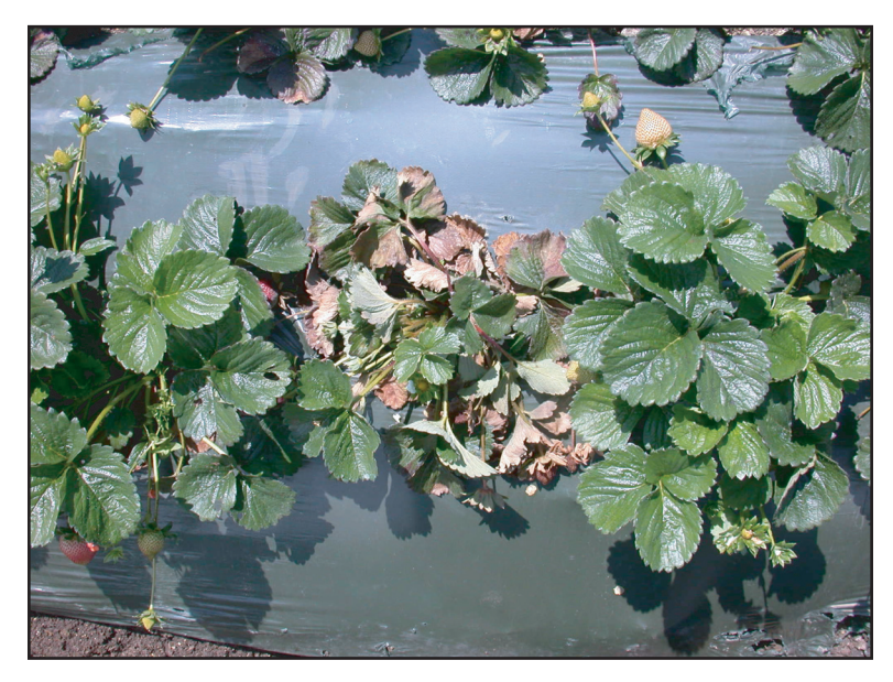
Figure 2. One plant (middle) is showing dieback symptoms typical of Verticillium wilt. The others are healthy.

damage to the root system and will not necessarily cause any internal discoloration in the crown of the plant.