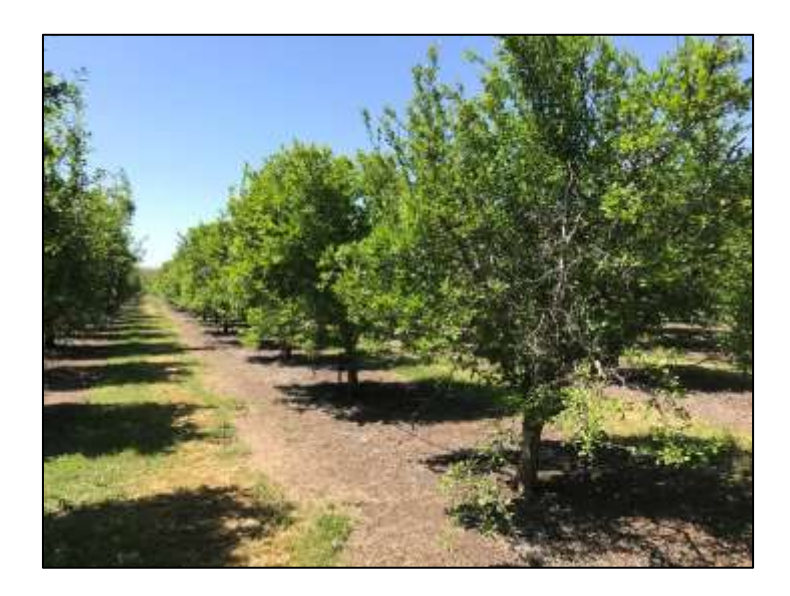
Figure 1. A 15-year-old orchard that has been mechanically 'boxed' for seven years showing branch dieback (tree on the right). The orchard manager had not previously protected pruning wounds with a fungicide but plans to start this year.