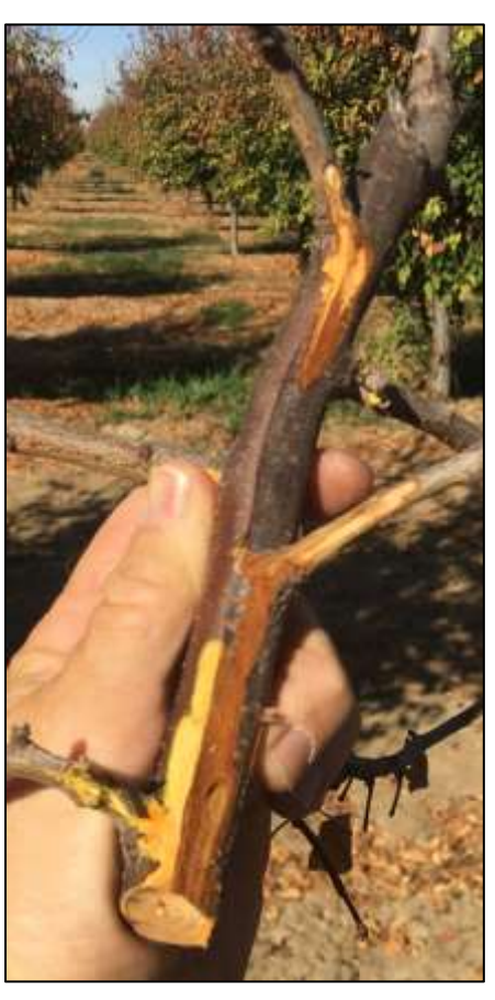
Figure 1. A clearly delineated Cytospora canker (brown dead bark; pruning wound infection) in young prune orchard with widespread infection (fall 2018).

During the post-harvest period, two key management practices in orchards with Cytospora are to avoid tree water stress by carefully managing irrigation and pruning out existing cankers. Cutting out existing cankers should be performed during the growing season when enough leaves are still present to easily identify these girdled branches. Leaves on these branches are likely either in decline or dead and remain frozen in place. These branches with sunken cankers should be cut several inches, to one foot below any cankered bark (check for darkened edges, see figure 2). If the canker is not completely removed, the disease is still in the tree, and money is wasted. To reduce disease inoculum, remove and destroy cankered wood that is pruned out, as well as trees killed by Cytospora .