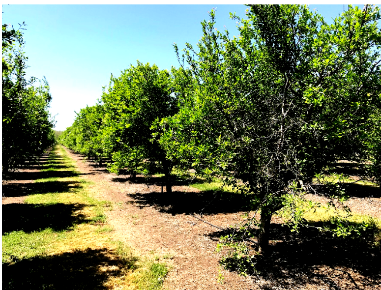
Figure 1. A 15-year-old orchard that has been mechanically ‘boxed’ for seven years showing branch dieback (tree on the right). The orchard manager had not previously protected pruning wounds with a fungicide but plans to start this year.

1 We are unaware of any growers who have eliminated hand pruning of young trees. Careful hand pruning is still needed to develop trees that will carry good to heavy crops year after year for the life of the orchard.