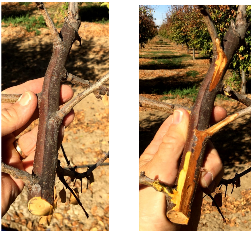
Figure 1. A clearly delineated Cytospora canker (brown dead bark; pruning wound infection) in young prune orchard with wide-spread infection (fall 2018).

During the post-harvest period, two key management practices in orchards with Cytospora are to avoid tree water stress by carefully managing irrigation and pruning out existing cankers. Cutting out existing cankers should be performed during the growing season when enough leaves are still present to easily identify these girdled branches. Leaves on these branches are likely either in decline or dead and remain frozen in place. These branches with sunken cankers should be cut several inches to one foot below any cankered bark (check for darkened edges, see Figure 2).