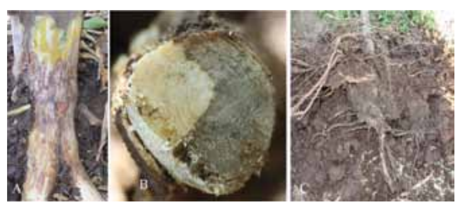
Fig. 1. Symptoms of dry root rot seen (A) around the crown, (B) in a cross section of a trunk, and (C) on roots.

Examples of symptoms found during our survey in 2010 are shown in Figure 1. Most of the previous studies conducted across California are highlighted below. The intent of looking back at previous studies is not to do a comprehensive review of them but to highlight the impacts of the disease over time in the state and connect historical