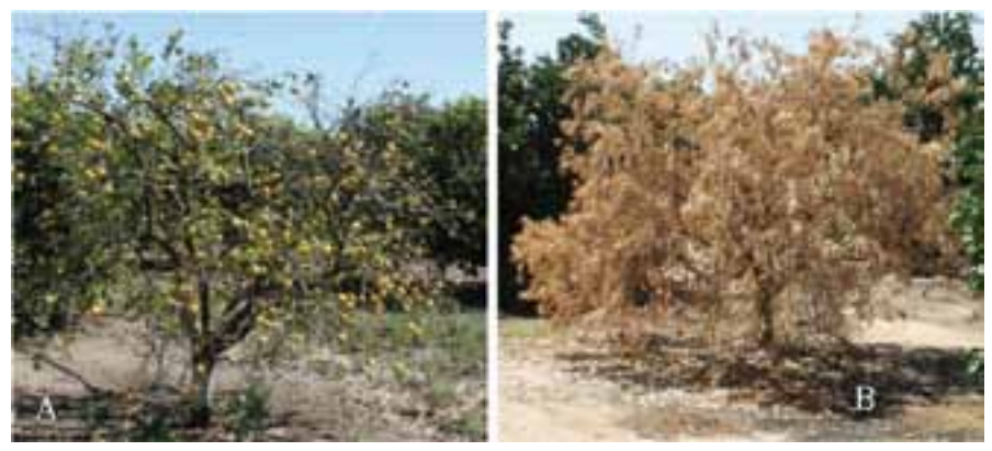
Fig. 3. Infected trees - (A) Lemon in Ventura County and (B) Navel orange in Tulare County.

Irrigation should be done with care in which application matches tree water requirements, and the trunk is kept dry. Attention should be paid to drainage because water should not be allowed to stand in contact with the tree crown for an extended period of time. Movement of equipment facilitates spread of the pathogen, so equipment should be well cleaned before moving it between orchards. Proper fertilization will minimize stress and opportunity for the disease; insufficient or excessive nutrient applications should be avoided. Rodent control and the careful use of herbicides