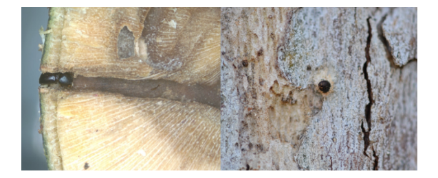
Figure 2: Shows a female shot-hole borer blocking the entry hole with her abdomen (A) and in cross section (B).

affected trees which too often result in complete removal of infested trees.