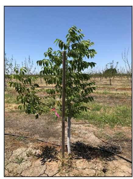
Graft failure RX1 trees with growth in the seepage zone