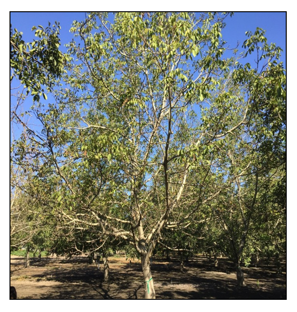
Topping/heading this tree is unlikely to help in tree survival.