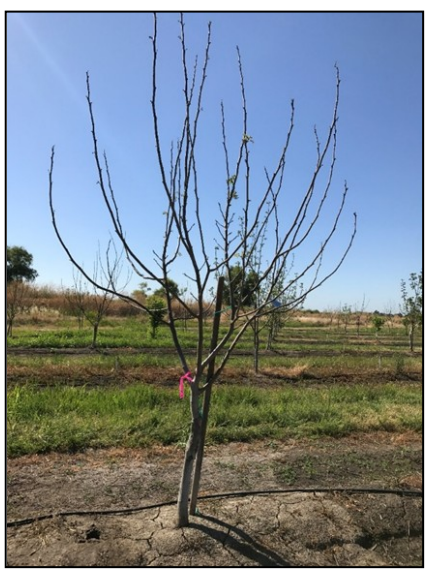
Trees failing to push in the seepage zone