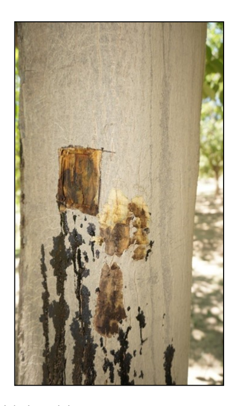
Bleeding cankers associated with aerial Phytophthora on a river bottom walnut tree (taken in August 2017).