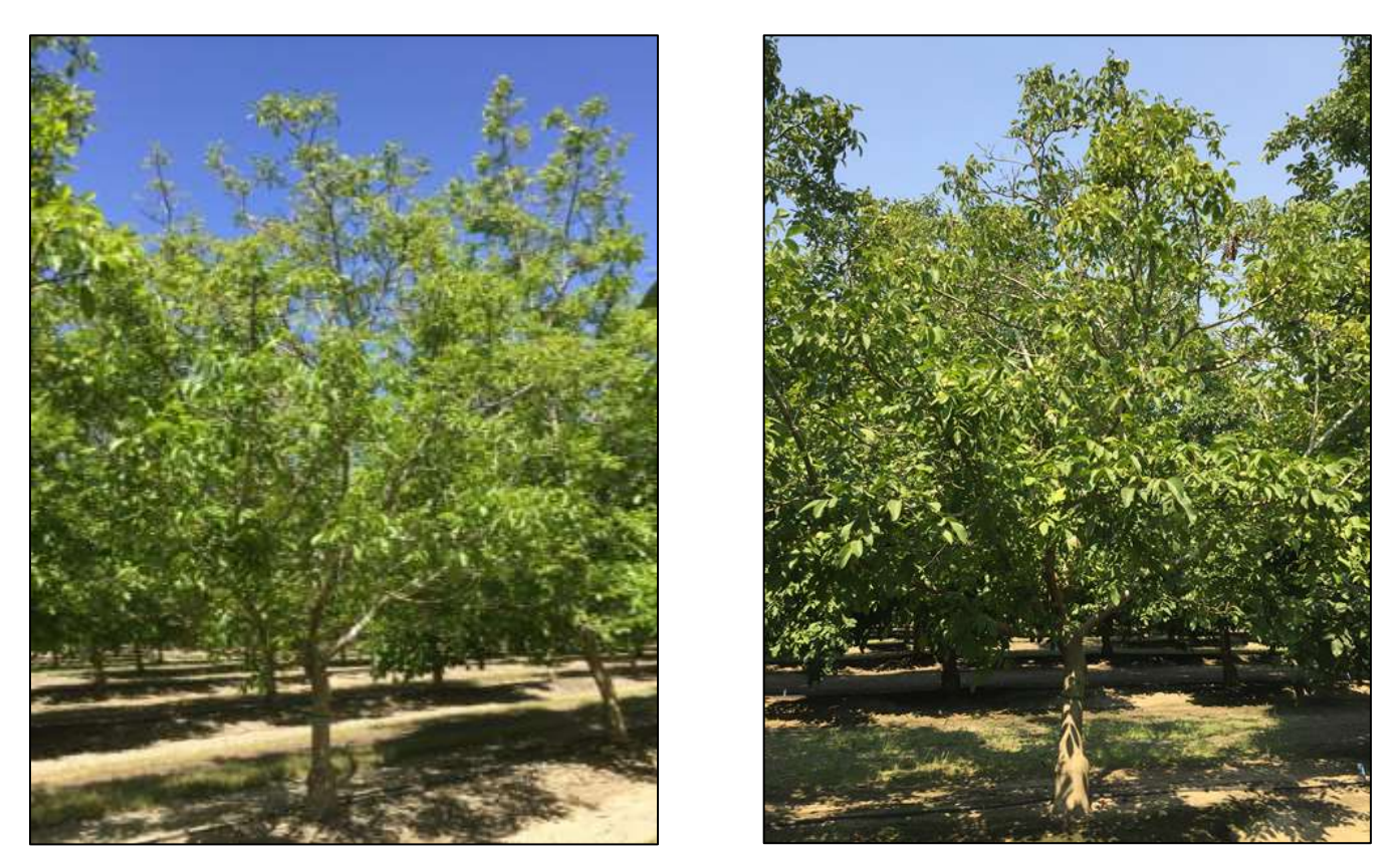
Figure 4. This Chandler orchard experienced prolonged flooding in 2017. Tree prior to light topping of upper limbs on May 3, 2018 (left). Same tree on August 2, 2018 (right).

Figure 3. A tree with totally decayed roots that blew over during strong winds in May 2018 in an orchard that experienced prolonged seepage below the soil surface in 2017.