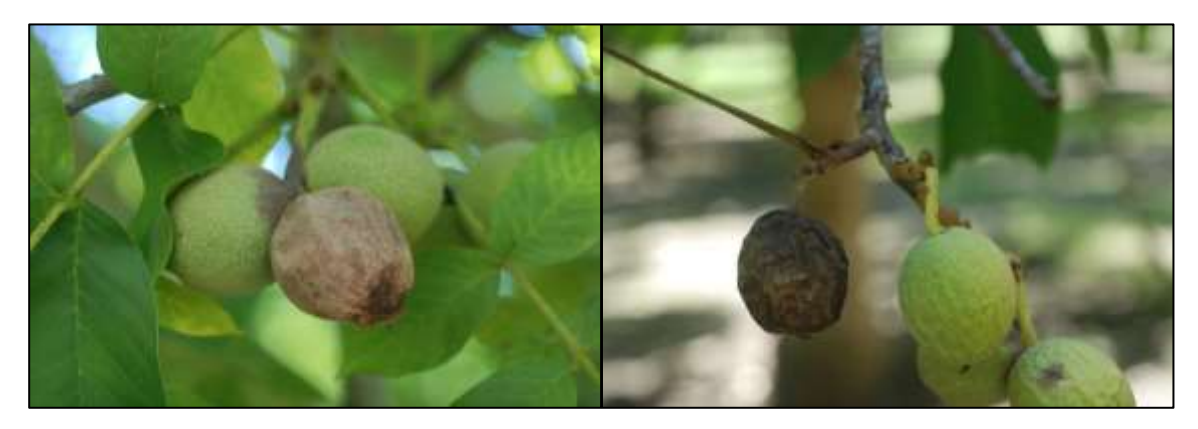
Figure 1. Blighted fruit caused by BOT showing pycnidia in early September.

Therefore, if pruning or hedging is planned this year, aim for as early in fall as you can and when weather is forecast to be dry. Deadwood removal however, is best done through the dry summer months.