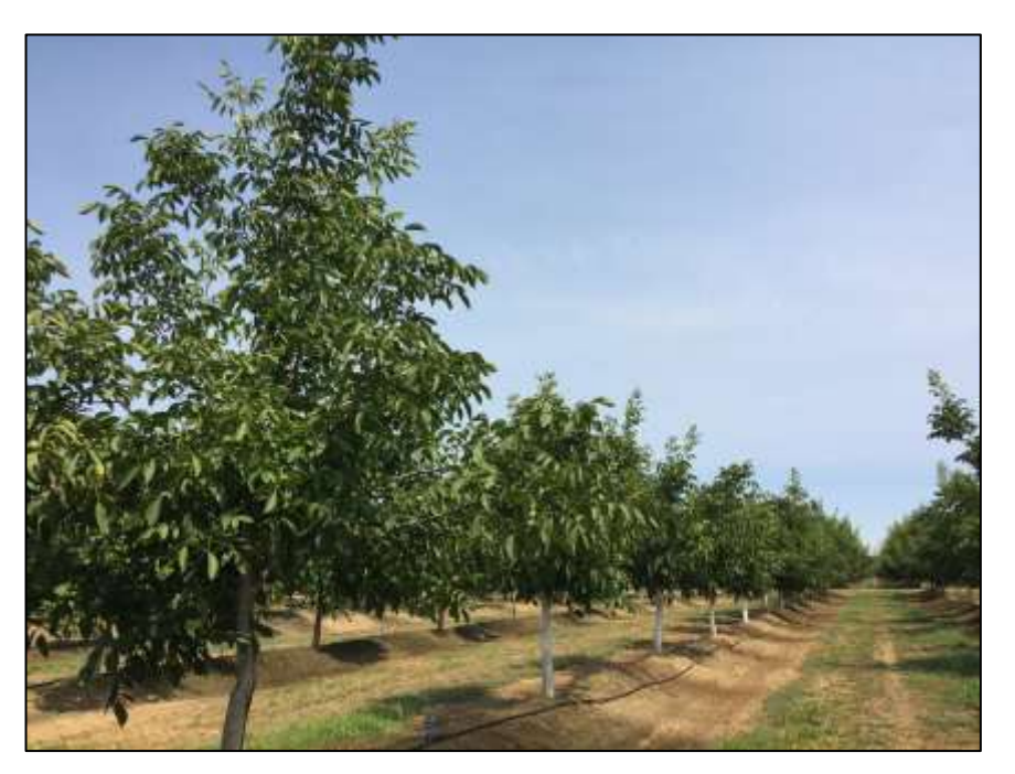
Figure 5. July 2018 growth response of 2017 flood damaged 5-year-old trees that were topped in May 2017 (trees with white trunks) vs. a less affected tree in the foreground that had little pruning.