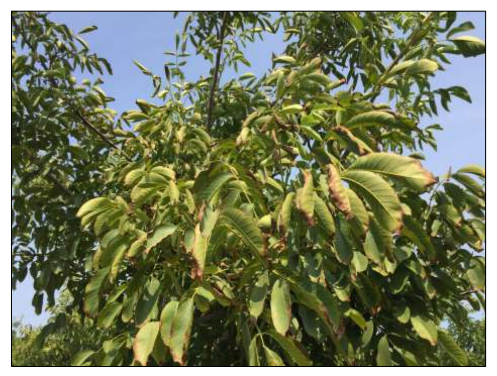
Figure 6. Scorched outer leaf symptoms in same flooded orchard in July 2018 indicative of too much water due to over irrigating with a high water table. Photo credit - Janine Hasey.

Figure 5. July 2018 growth response of 2017 flood damaged 5-year-old trees that were topped in May 2017 (trees with white trunks) vs. a less affected tree in the foreground that had little pruning. Photo credit - Janine Hasey.