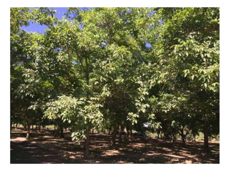
Figure 2. Overall tree canopies appear healthy in a severely aerial Phytophthora infected river bottom orchard in June 2018.

Figure 1. Bleeding cankers associated with aerial Phytophthora on river bottom walnut trees in May (left), June (center), and July (right). New tissue is forming around cankers in June and July as indicated by blue arrows.