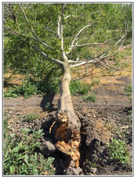
Figure 3. A tree with totally decayed roots that blew over during strong winds in May 2018 in an orchard that experienced prolonged seepage below the soil surface in 2017.