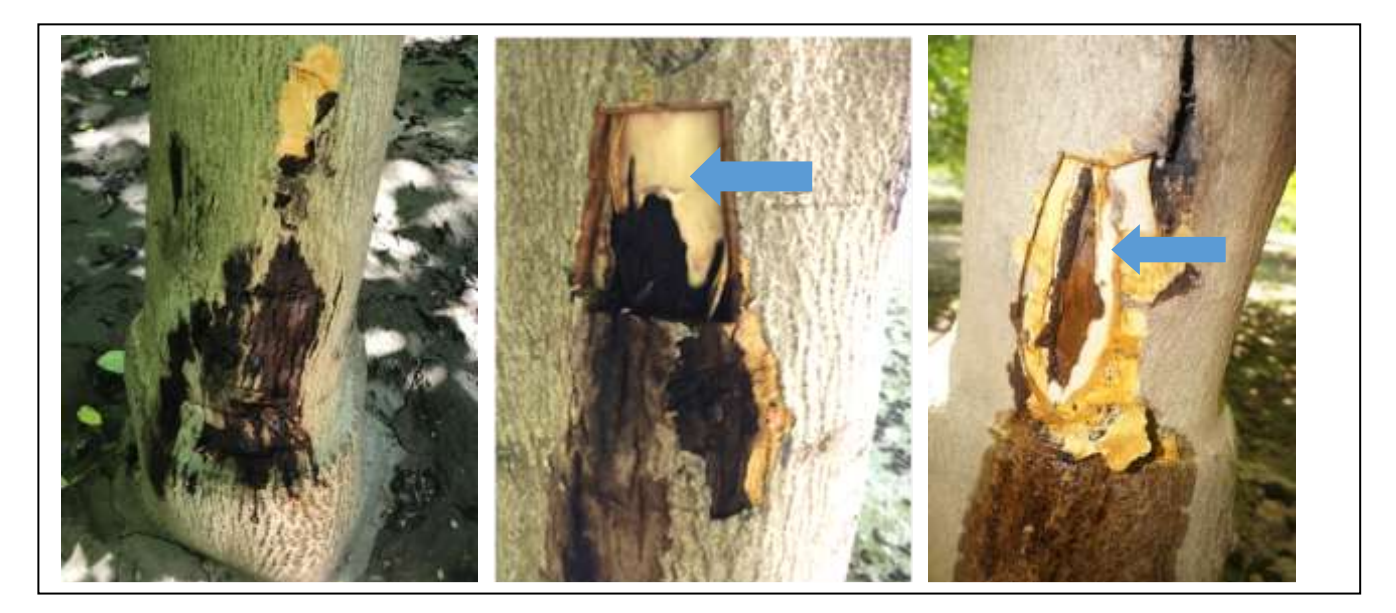
Figure 1. Bleeding cankers associated with aerial Phytophthora on river bottom walnut trees in May (left), June (center), and July (right). New tissue is forming around cankers in June and July as indicated by blue arrows.