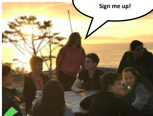
PDR #3 State Event Attended #6 Share experience to clubs