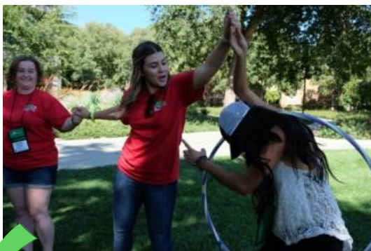
PDR #3 Event (SLC) Attended #4 Statewide Committee