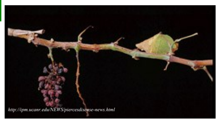
Grape Vine Infected by Pierce's Disease

(Continued from Page 7 - Glassy Winged Sharpshooter; Xylophagous Leafhopper)