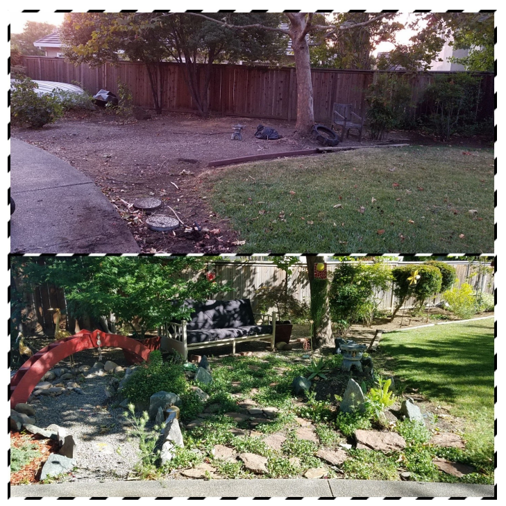
Before and After Photos of Japanese Garden

I started this project in November 2017, and was able to finish it in time for the Master Gardener Garden Tour in April 2018. I am so proud of the results! I have attached before and after