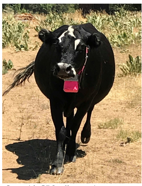
Cow with GPS collar grazing on Plumas National Forest.

Preliminary results from phase 1 (Figure 1, page 2) show a disconnect between the literature focused on "active" (green) and "passive" (purple) management interventions.