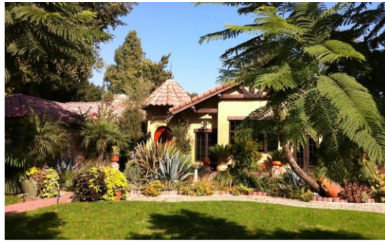
The Central Valley has many forms of architecture and garden themes. Innovative designs using climate appropriate plants and reduced lawn size help make these gardens Central Valley Style.