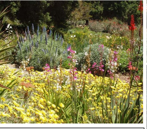
Mulching, watering with drip irrigation, managing storm water runoff, and reducing yard waste are key sustainable practices.