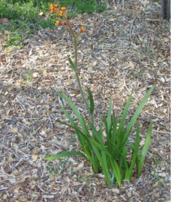
Permeable pathways and intermingling food producing plants with herbs and ornamentals are elements of Central Valley Style.