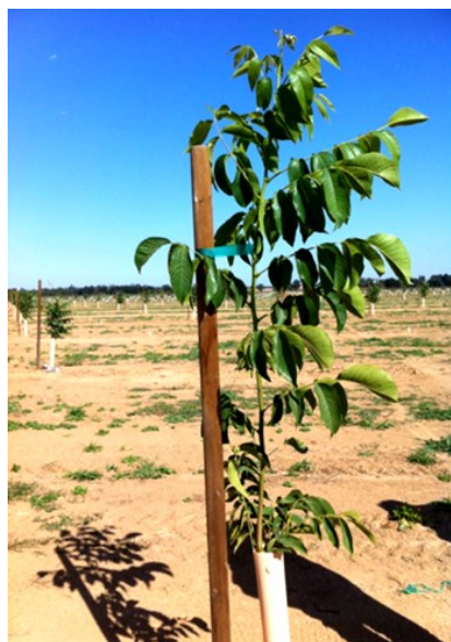
Photo 1 (left): Tie developing trunk loosely to the stake through the summer.