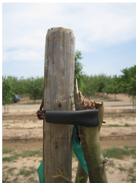
Photo 2 (right): Photo 2. When developing trunk is tied too tightly to the stake, there is no flexing during windy weather resulting in a weak trunk prone to breaking near the top of stake.