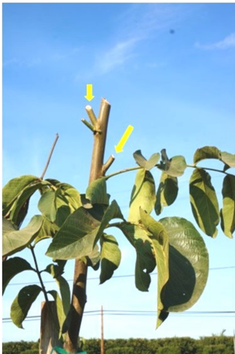
Photo 3. 1 st leaf tree headed in July forcing primary buds (yellow arrows) that were headed again in September.