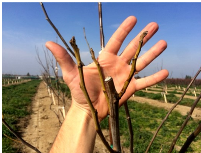
Photo 4. Tree at first dormant pruning that was headed the summer before during first leaf which forced primary buds to grow. These must be removed.