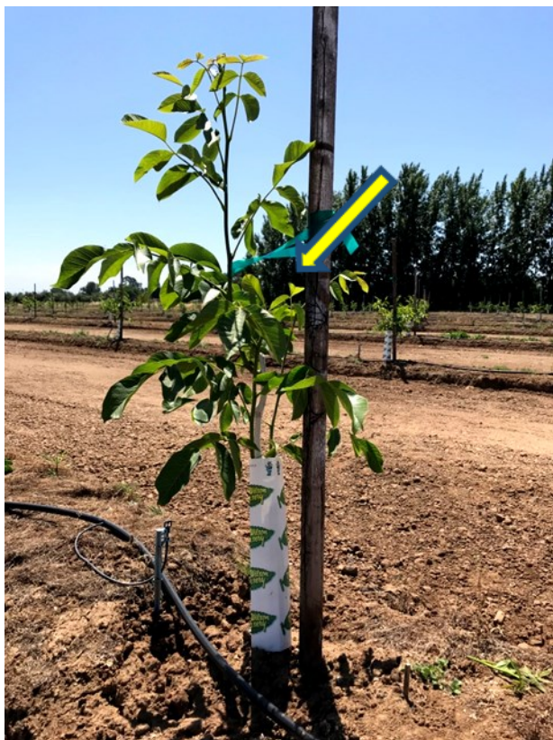
Photo 5. A nursery grafted tree cut back to about 4-6 buds above graft union in March. Select the strongest shoot to train as the trunk and tie loosely to the stake. Cut side shoots back to about a foot (yellow arrow). (L. Milliron taken May 21, 2018)