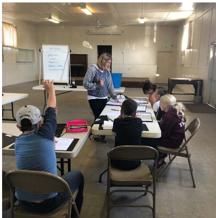
Upper Lake Sheep project April Meeting