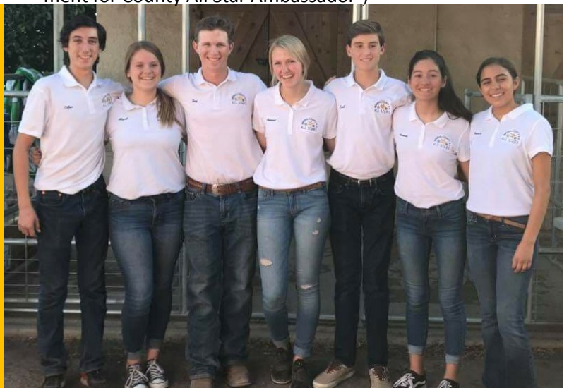
Pictured Above 2017-2018 County All Star Ambassador Team