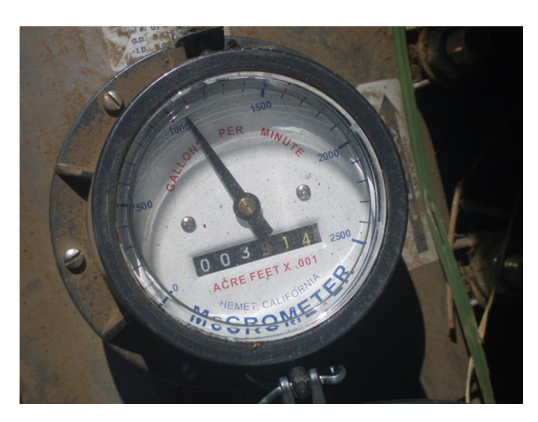
Northeastern CA Water Association, Shasta Land Services University of California, Cooperative Extension

Wednesday, March 21, 2018 12:30 p.m. - 4:00 p.m. Adin Community Center Adin