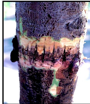
Figure 1. Left: Tree showing band canker symptoms after infection events over multiple seasons. Right: Growth cracks provided an entry point for infection in this tree.

Most cultivars can be infected by band canker, though certainly some are more susceptible than others. In my experience, Wood Colony seems to be extremely susceptible. Artificially inoculated trees developed the largest cankers in the Sonora, Carmel, Padre, and Nonpareil cultivars (Wood Colony was not tested). Trees are typically most susceptible from 4 th – 6 th leaf, though infections in 2 nd and 3 rd leaf orchards are becoming more common in recent years. There is a complex of Botryosphaeriaceae fungal species responsible for development of