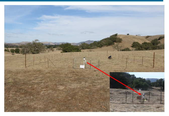
One of Advisor Larsen's forage production plots in Santa Barbara County. At this site rainfall, and forage production will be measured. In addition, a time lapse camera was set up to take a photo each day to record forage growth.

There are close to one million acres of native pasture and forestlands in Santa Barbara County, which are collectively referred to as rangelands. Comprising approximately half of the acreage of the County, these lands provide opportunity for multiple purposes. Rangelands serve as watersheds to capture, store, and release water for downstream uses; they provide forage for grazing by livestock; and their diverse plant communities provide habitat for many species of wildlife and recreational uses. The UC Cooperative Extension Watershed and Natural Resource Program provide educational programs to inform people who own and/or manage the land and the animals grazing these lands. This work also includes applied research to develop new knowledge to effectively and efficiently manage rangelands and livestock in today's competitive and regulatory environment.