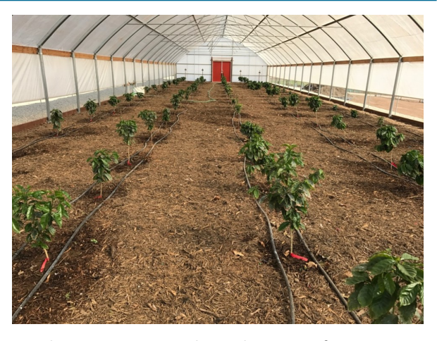
Trials in Santa Maria evaluate alternatives for intensive trellising of different varieties to improve yields and harvest efficiency of California-grown coffee.

Field trials are conducted often and the results of these trials, associated greenhouse or laboratory studies, and the experiences of other specialists are then assembled into educational outreach programs to educate and guide growers and industry representatives on the best current science-based information.