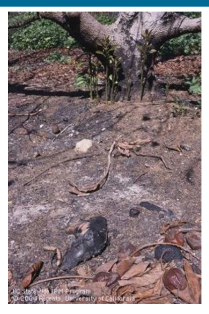
Avocado damage from Thomas Fire, suckers emerging

Additionally, he visited orchards to help assess damage. Along with the California Avocado Commission, the USDA's Risk Management, Farm Service Agency and Natural Resource Conservation Service, a three-day Disaster Workshop was organized so that agricultural producers, including growers from Ventura and Santa Barbara Counties could have a one-stop site to fill out paper work to obtain recovery assistance. These workshops were attended by flower growers, tree growers, beekeepers and cattle ranchers. A total of 85 made appointments in advance and there were 24 walk-ins. The funding will help producers with less than $900,000 gross annual income rebuild their operations.