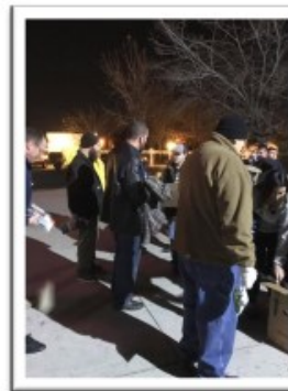
Handing out Coats, Beanies, Socks and snacks to the homeless at the Bakersfield Rescue Mission.