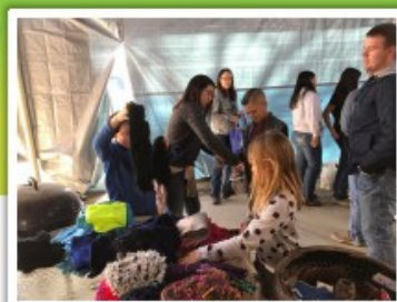
Sorting items donated to the blanket and coat drive.