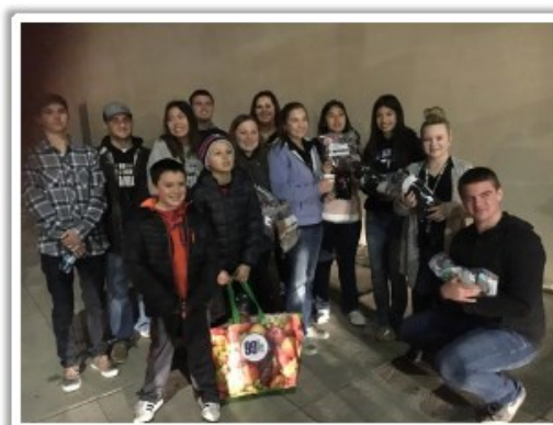
Southwest 4H Leadership Group prepared to hand out donated items to the homeless.