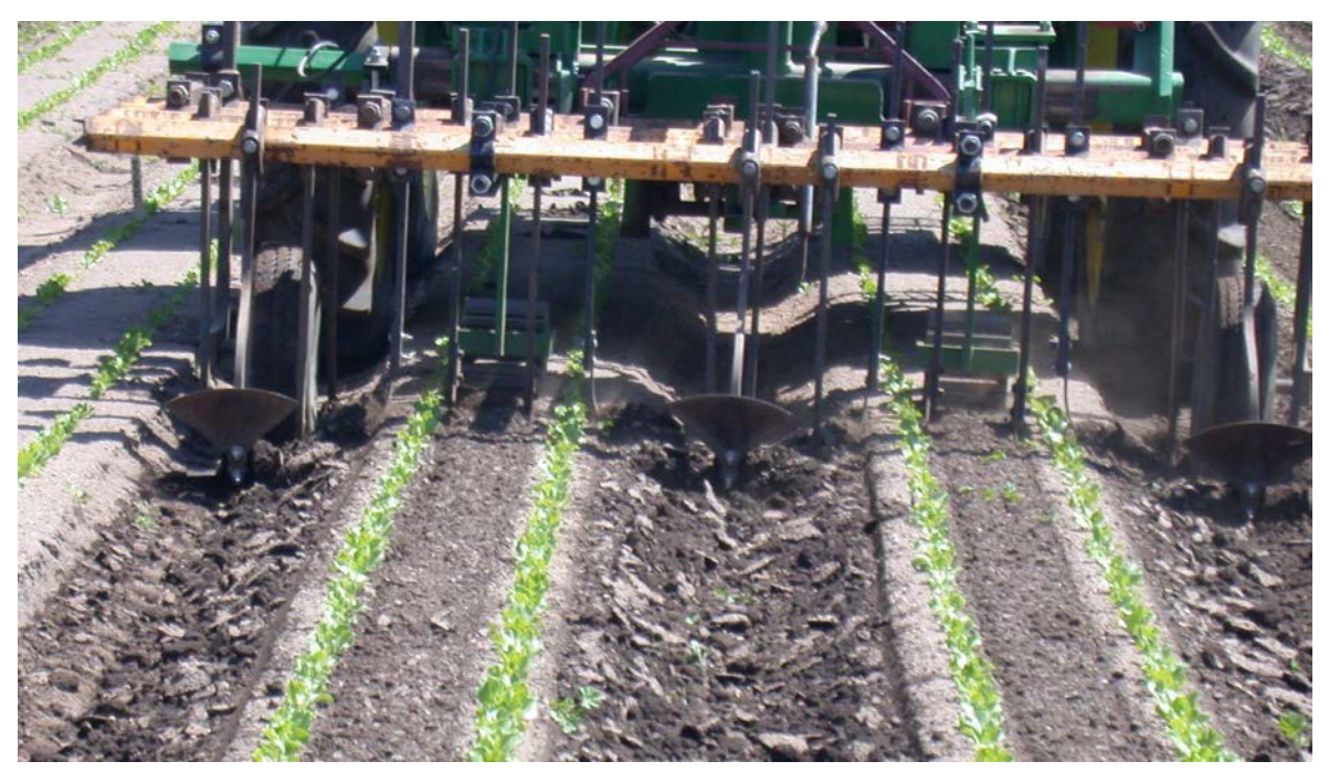
Figure 3. Row-crop cultivators may include combinations of bed knives, rolling baskets and duckfoot sweeps.

Sled-mounted cultivators can give very accurate control in row plantings. Sleds require more tractor power to pull than gauge-wheel cultivators but provide greater precision for vegetable row-crop production. Guide wheels (cone wheels, rubber guide wheels, etc.) also can improve the precision of cultivations if set up properly (fig. 3). Sled cultivators are generally rear-mounted on the tractor. Cultivators can also be set up on tool bars mounted between front and rear wheels of a row crop tractor with an off-center driver seat and steering column to allow for easy viewing by the operator.