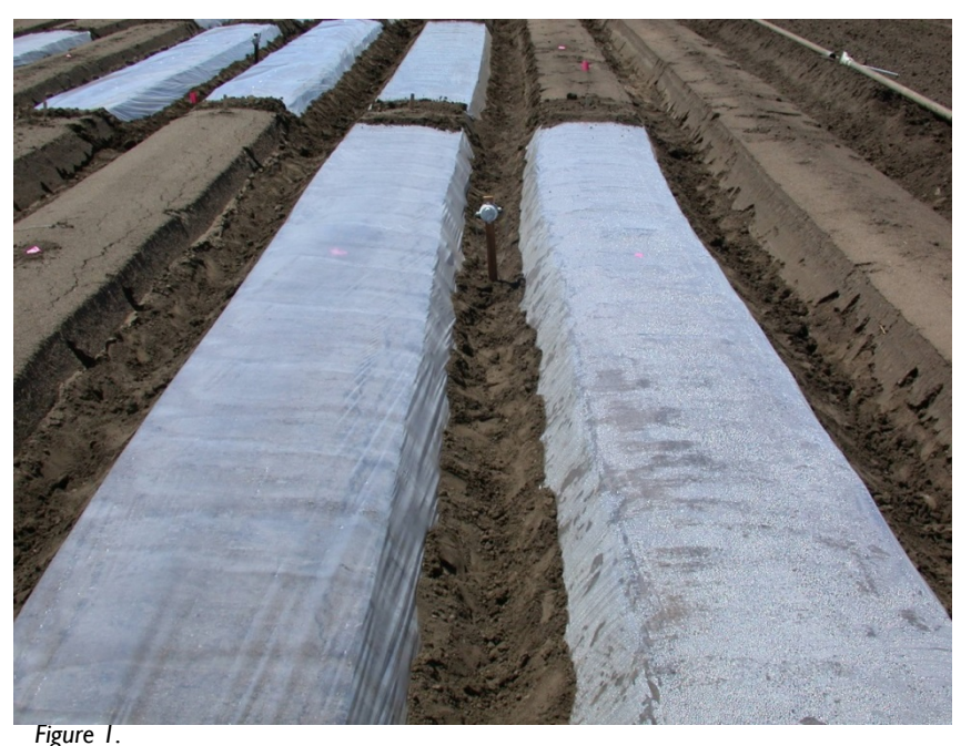
Soil solarization with clear polyethylene tarp prior to planting strawberry.

Solarization kills weed seed by exposure to heat for a critical period of time, which is why treatment is required for 4 to 8 weeks - to ensure that the soil temperature reaches critical soil temperatures and durations needed to kill weed seed, especially several inches below the soil surface. Moisture helps by holding heat in the soil and by germinating seed so that they are easier to kill with solarization. Dormant seed are also killed, but they