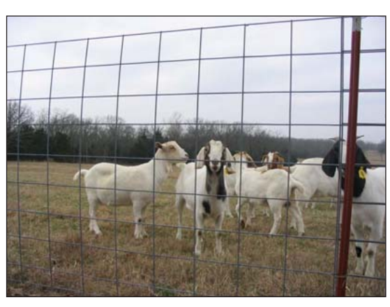
Although expensive, cattle panels make secure goat fencing.