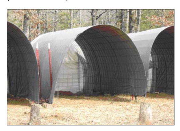
Cattle panels with a tarp stretched over them provide adequate shelter for goats.

Housing needs for meat goats are very simple, and in moderate climates may consist of natural cover such as thick trees and brush or rock ledges. Goats do need protection from rain and from cold wind and snow. A sturdy shed, open to the south, with rear eave height of 4 to 6 feet and front eave height of 6 to 8 feet will help conserve body heat. (The shed will be more difficult to clean out if the roof is this low, however.) For night shelter, allow 5 square feet per goat. If the shed is near the farmhouse, predators may be deterred. One problem with a permanent shed is that constant traffic will keep the ground bare, leading to erosion. A movable shed (on skids) is one possible remedy.