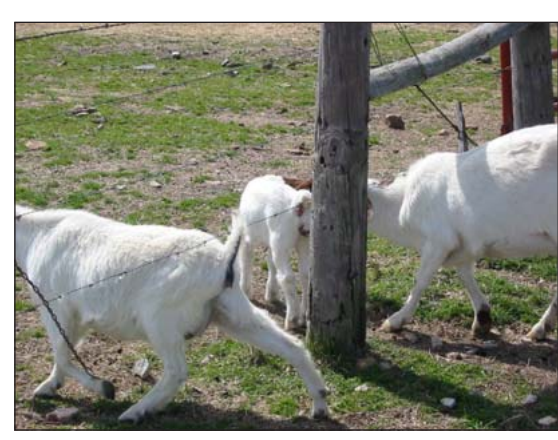
Conventional ranch fencing is inadequate for containing goats.

Woven wire fencing can have vertical stays 10 or 12 inches apart, rather than 6 or 8 inches. This allows horned goats to avoid entrapment. (Harwell and Pinkerton, 2000) Be aware that the larger spacing will allow weanlings to slip through, unless there are offset hotwires attached to the fence. Another popular choice for fencing is a 4x 4-inch woven wire. This keeps animals in, and the openings are small enough to prevent heads getting stuck.