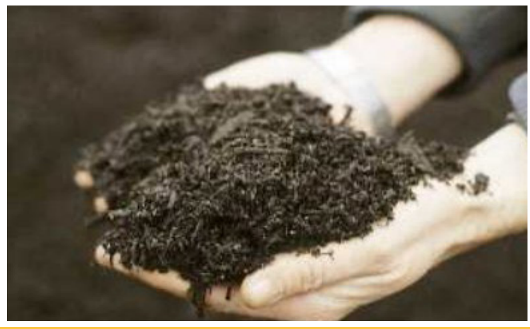
Division of Agriculture and Natural Resources, University of California